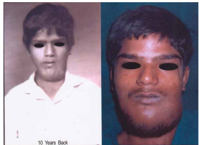
Figure 1 Extraoral photograph taken 10 years back and at present.

The blood picture was normal except for increased ESR (60/mm 1st hr). Orthopantomograph and lateral cephalogram revealed soft tissue shadow with no bony involvement. Computed tomography showed non homogenous mass of soft tissue density in the buccal aspect with no evidence of bone destruction which gave an impression of benign non-enhancing lesion of soft tissue mass. A provisional diagnosis of haemangioma was made with differential diagnosis of lymphangioma and rhabdomyoma.