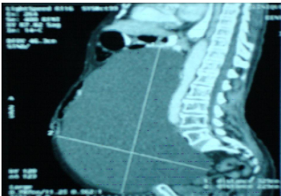
Figure 1: Reconstruction of the image with CT scan, giant intra-abdominal mass.

Median laparotomy was performed and a 30 cm retroperitoneal cyst was found. Ovaries and uterus were normal. Uneventful cyst cleavage was performed after liberation of some intestinal and epiploic adhesences (figure 2). The cyst contained sebaceous matter and histological examination shows that the cystic wall was lined with flattened squamous epithelia with a distinguished granular layer. The cystic space was filled with a large amount of keratinized material. The histology was compatible with an epidermoid cyst. The post operative course was uneventful and the patient was doing well at the 5 months follow-up visit.