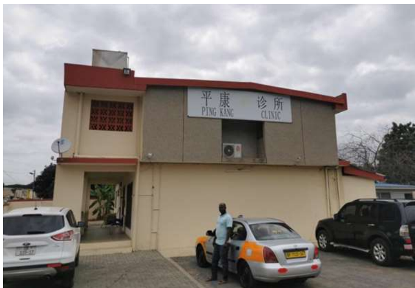
Figure 8: Ping Kang Clinic

Ping Kang Clinic, a clinic established by a younger generation of Chinese in Tema, was one of the institutions he visited. In recent years, the number of Chinese immigrants in Tema has gradually increased, establishing numerous institutions catering to the Chinese population. Due to time constraints, he could only gain a cursory understanding of the clinic at that time. The doctor on duty that day was a female practitioner from Hubei. Her family remained in China, yet she had travelled thousands of miles to live and work in Ghana. She arrived in Ghana in April 2019 and spent three years working there, yet she has not been able to return home due to the pandemic.