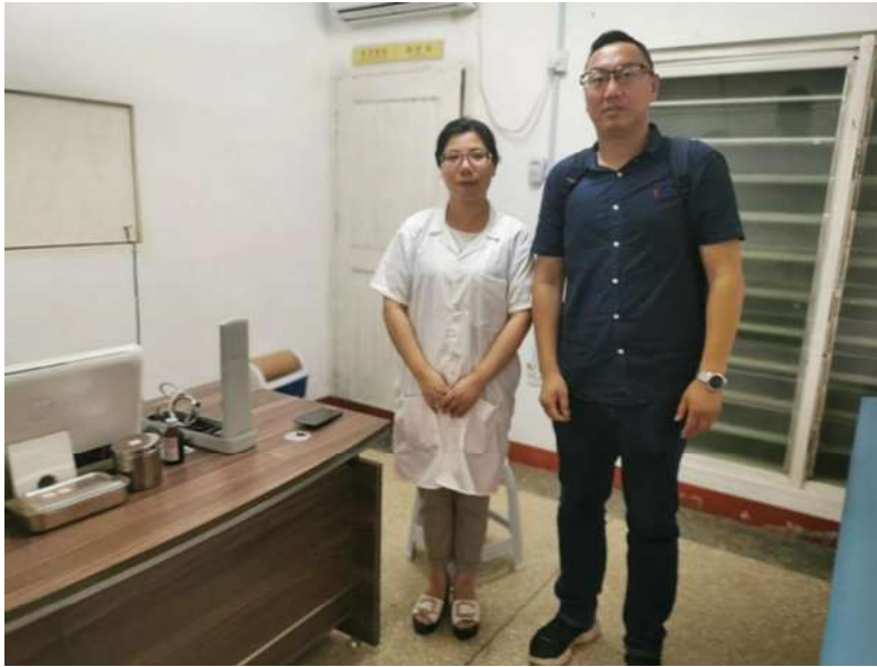
Figure 9: Chinese Doctor from Hubei