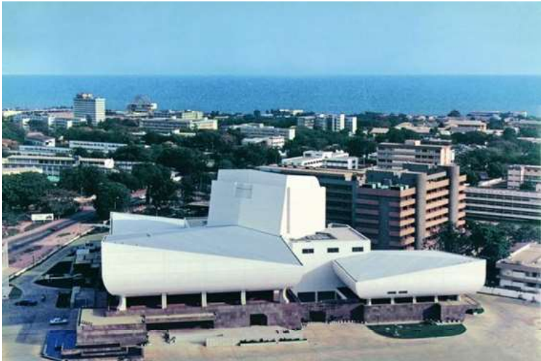
Figure 1: The National Theatre