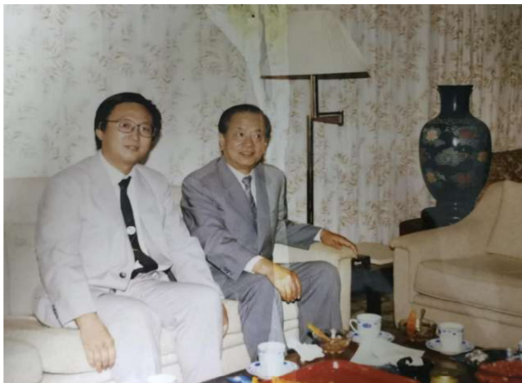
Figure 3: Wang Lizu(left) and Qian Qichen (right)