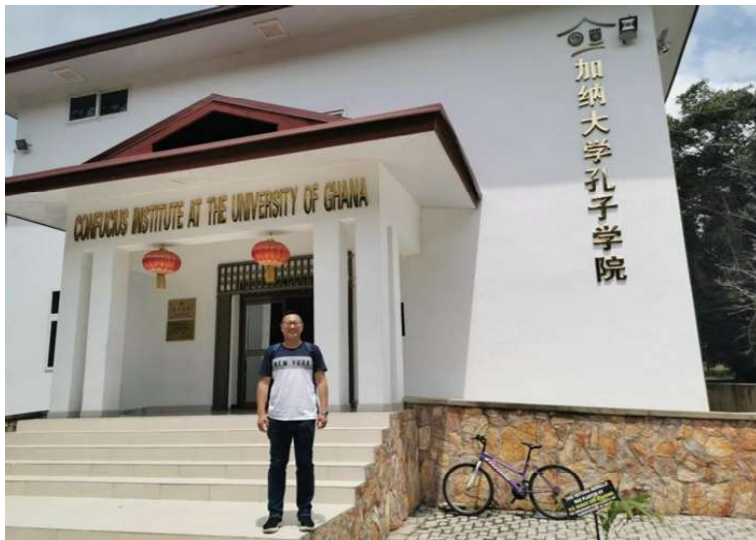
Figure 7: Confucius Institute at the University of Ghana

This research activity was facilitated by local friends in Africa who provided him with a research assistant, a vehicle and driver, and office amenities. Most of the scientific data were collected at the University of Ghana. Following his visit to the University of Ghana, he toured various institutions on campus, including the Language Centre, Confucius Institute at the University of Ghana, the Department of Sociology, and the Institute of African Studies.