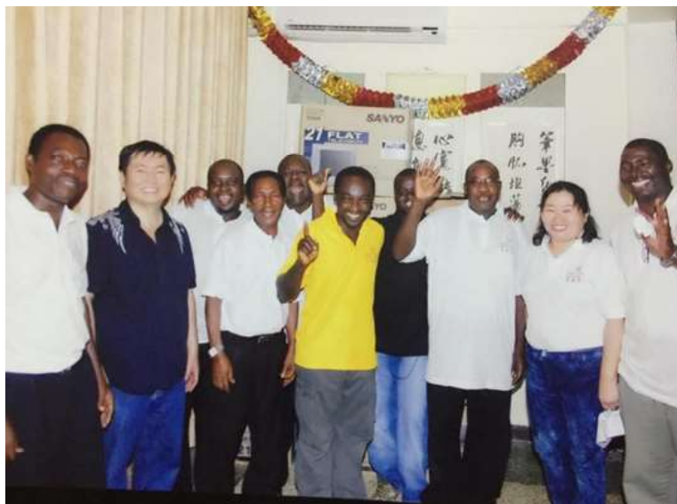
Figure 14: The photograph was taken ten years ago. The restaurant has been in operation for twenty years. Most of the employees shown in the photograph are still working at the restaurant.