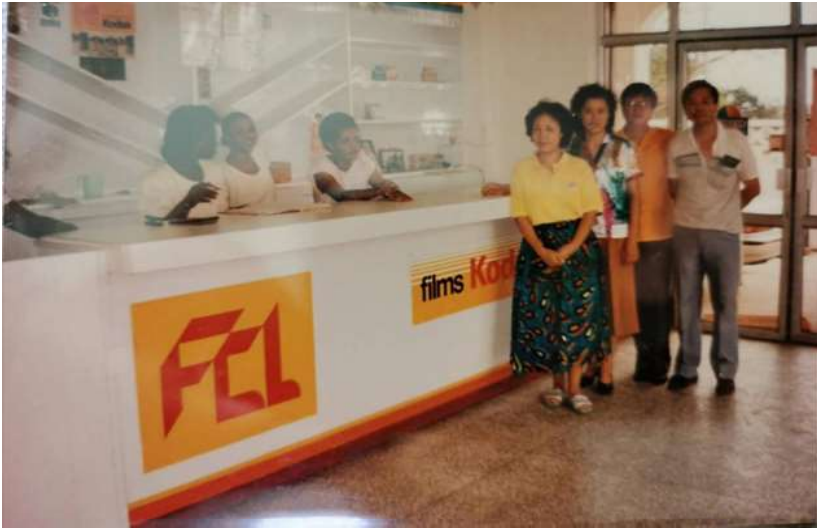
Figure 6: The interior lobby of the photo studio building