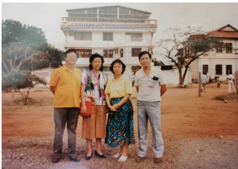
Figure 5: The background of the photo studio building.