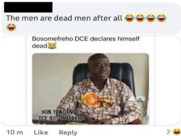
Figure 16: The men are dead

Using laughing emojis and the text “the men are dead after all”, the author reinforces the humour while at the same time questioning the competence of the government since dead men cannot work and achieve anything.