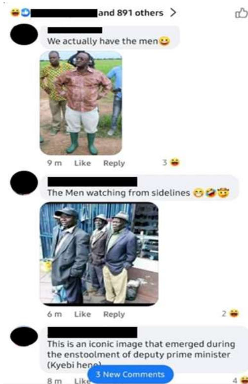
Figure 14: Allusion to lack of foresight

The perceived incompetence is again emphasized in the following comments in Figure (14), which centres on lack of relevant ideas and solutions.