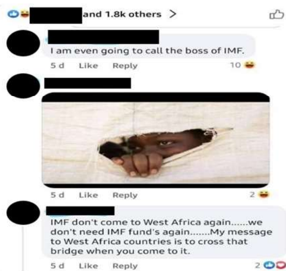
Figure 4: A plea to IMF