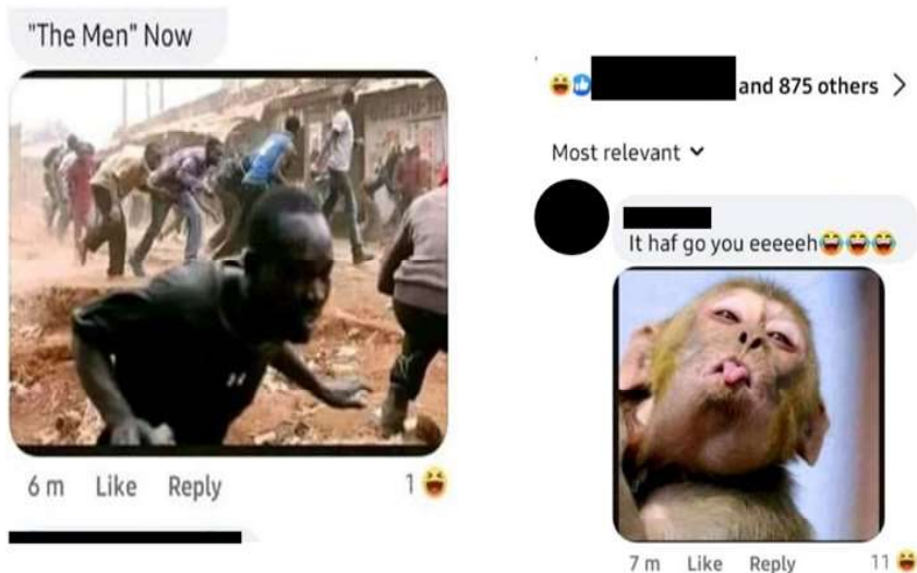
Figure 13: Allusion to unmanliness

Like the original post in Figure (12), the combination of the written text “the men’ now” and an image of men running for cover in Figure (13) highlight the incongruity, hence humorous.