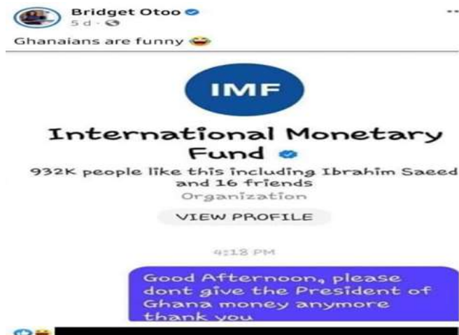
Figure 2: Ghanaians are funny

the humour in the original post (Figure 2), thereby downgrading the seriousness of the situation. It is worth noting how she evokes a play frame by combining various modes (the text ‘funny’ and a smiley emoji with tears of joy) to communicate her message.