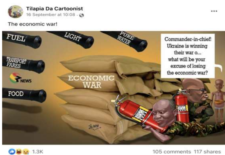
Figure 6: Economy at war

In one of the posts from a renowned Ghanaian cartoonist 6 (Figure 6), the economic crisis is described using a war metaphor. With reference to our multimodal discourse analytic approach (Kress, 2011; Jones, 2013), it is worth mentioning that the cartoonist conceptualises the crisis in terms of war, not only through verbal texts like “economic war”, but also through images that depict a war zone. Such images include grenades, sandbags for fortification, and the finance minister and the president (commander-in-chief) attired in military outfit.