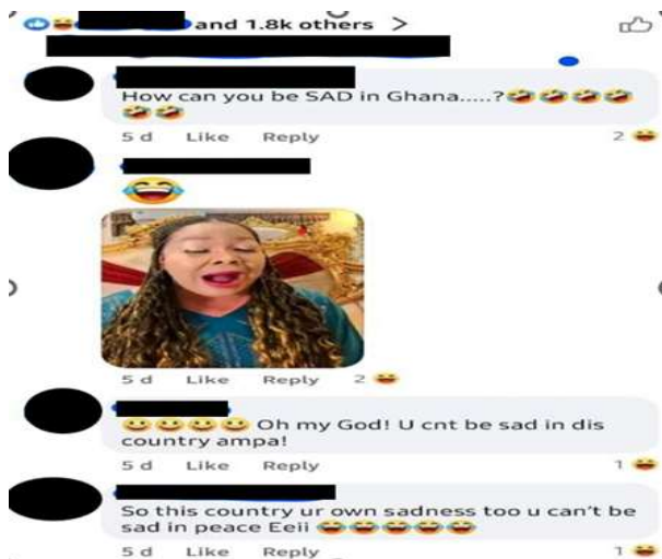
Figure 5: How can you be SAD in Ghana?

Still sharing in the humour of Figure (2), some netizens allude to humour as a tool for making light of the burden associated with Ghana’s increasing economic crisis. Figure (5) illustrates this (see also the last comment of Figure 10).