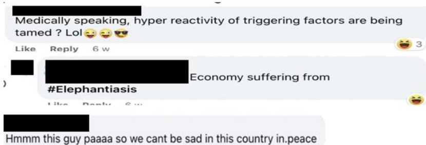
Figure 10: Comparison between economy and elephantiasis

The ridicule in Figure (10) is more pronounced when we consider how the author uses a rhetorical question to highlight a medical situation that appears impossible. He questions how hyper-reactivity of triggering factors can be tamed, implying the economic crisis is beyond repairs.