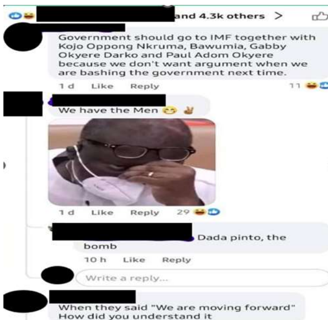
Figure 15: Trolling government officials

Juxtaposing the text “we have the men” with this picture suggests as though he is bowing his head and covering his face from shame for not delivering on their promises, thus questioning their competence.