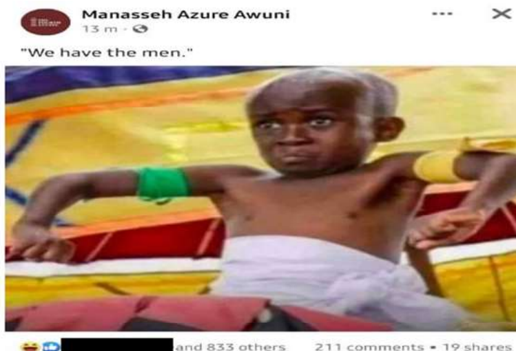
Figure 12: When the 'men' are 'boys'

On 4th September 2015, the President of Ghana (then in opposition), tweeted that they have the men and women to properly manage the affairs of the nation 10 . The message was retweeted on 4th October 2016 11 , and it became a trending campaign messages towards the 2016 general elections. After they won the election, however, it became a criticism each time Ghanaians felt the government had failed to live up to expectation, an example of which is the increasing economic crisis discussed above. Unlike in previous times, this one took a humorous turn, as shown in a post by a very popular journalist in Figure (12).