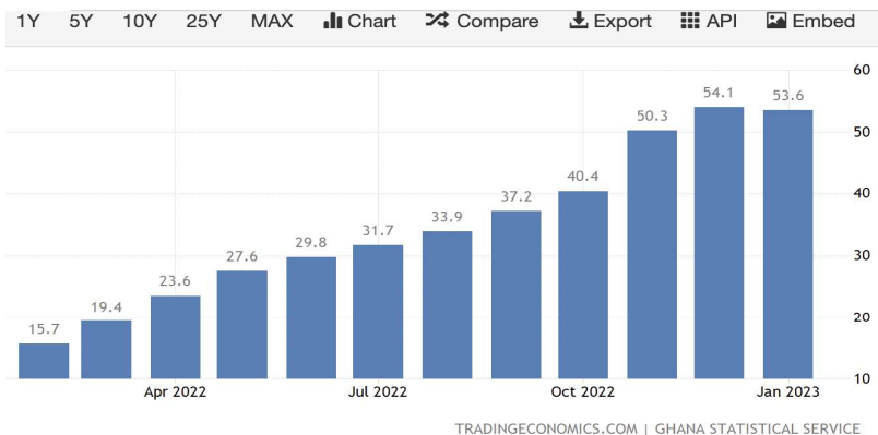
Figure 1: Ghana's inflation chart: February 2022-January 2023