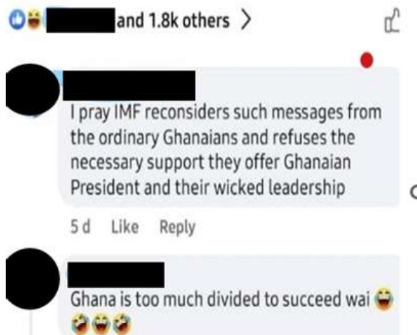
Figure 3: Ordinary Ghanaians vs. wicked leaders

the comments posted on Figure (2). We reproduce the comments here as Figures (3) and (4).