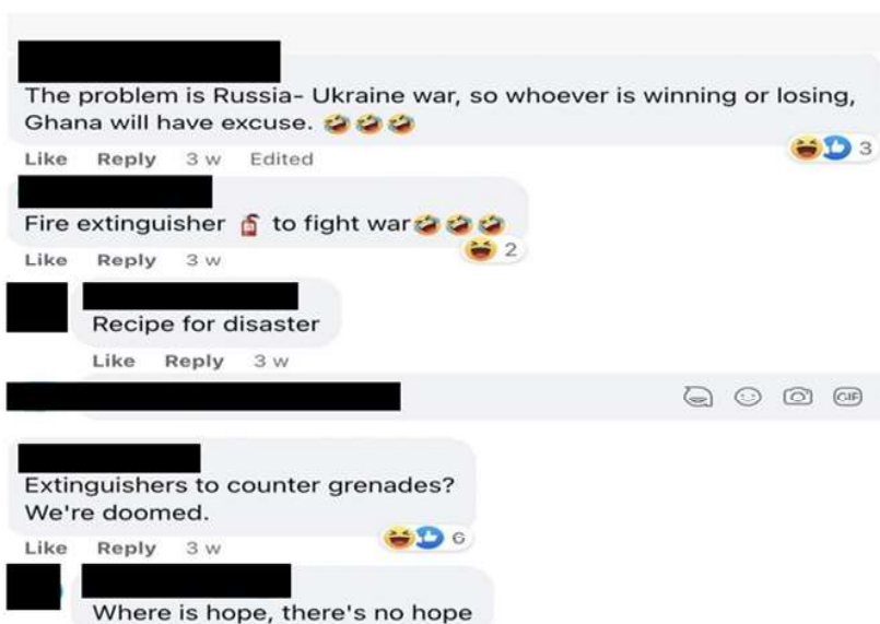
Figure 7: Allusion to Russia-Ukraine war

To get a better sense of the political critique, we reproduce some comments on the above post as Figures (7) and (8).