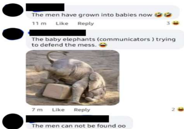
Figure 17: The baby elephants

Like in the previous examples, the authors in Figure (17) use various literary devices to not just create humour but also reinforce the message of the perceived incompetence.