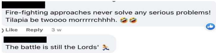
Figure 8: The battle is the Lord's

While sharing in the humour, the author of the first comment in Figure (8) also points out criticisms often labelled against African governments (Mbandiwa 2020, Atti and Gulis 2016). They are often accused of using reactive (firefighting) rather than proactive measures in dealing with problems. The comment reiterates the government's lack of foresight. That is, they fail to think ahead of time or anticipate problems and proffer the necessary solutions. They instead wait for the problems to come and then tackle them with measures that do not measure up to the magnitude of the problem (i.e., fire extinguishers against grenades).