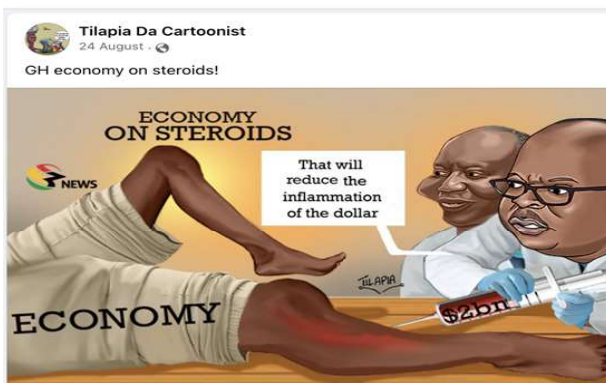
Figure 9: An economy with a medical problem

The second sub-theme uses an analogy from medicine, where the economic problem is viewed as a medical problem/condition. Figure (9) illustrates this further.