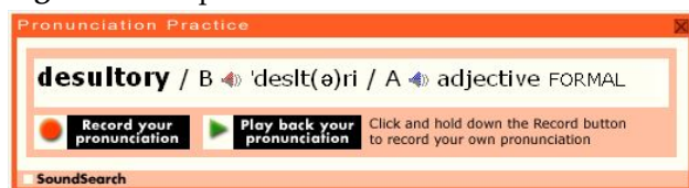
Figure 4: "Repeat after me" exercise in MEDAL1

This limitation, however, is not one of technology or pedagogy, but of imagination. For example, pronunciation practice could easily be combined with flashcards. Why is it that the only elements of an entry's microstructure used in flashcards are its headword and definition? Why not let the learner "type the mystery word" in response to its phonetic transcription or recording (dictation), or both, as well as to its definition? Why not flash the headword and ask the learner "Do you remember how to pronounce this word?", as well as "Do you remember what this word means?", the only option now built in?