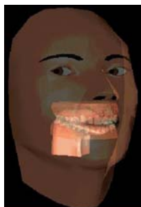
Figure 5: Baldi going transparent

The so-far lexicographically unimplemented type of potentially pedagogically useful phonetic representation is articulatory animation. Realistic avatars of the Baldi kind ( http://mambo.ucsc.edu/pdf/WilliamsRDD.pdf ) could be used, with speech animated in real time. Different perspectives, zooms, transparencies and tempos could be used (see Figure 5 below). The animation can be coordinated with a human recording or with TTS output. The technology is now mature for use in e-dictionaries. The benefits for e-dictionary EFL users are too obvious to elaborate on.