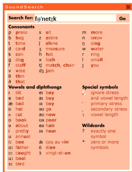
Figure 1: MEDAL1 SoundSearch phonetic keyboard

This is certainly a step in the right direction. Learners can now scan the dictionary for problematic homophones or phoneme clusters; teachers have an excellent tool for material and test preparation. As with many such new developments in contemporary lexicography, it remains to be seen just how user-friendly and useful these new access methods are in the actual EFL practice. Needless to say, there is practically no research yet in this area.