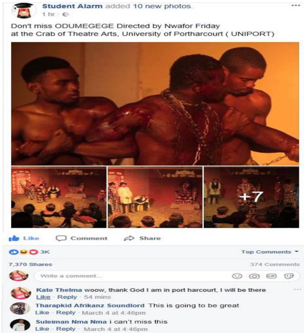
PLATE 2: Odumegege on trial before King Jaja

The plate above is a FACEBOOK post showing the proposed performance of Odumegege . The post attracted three hundred and seventy-four comments and seven thousand three hundred and seventy people sharing it. We can also see some of the interesting comments that read differently: