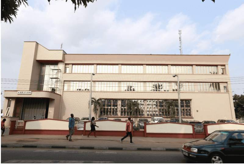
Figure 10: Frontal view of BoG Office, Kumasi showing ornamental façade on the windows