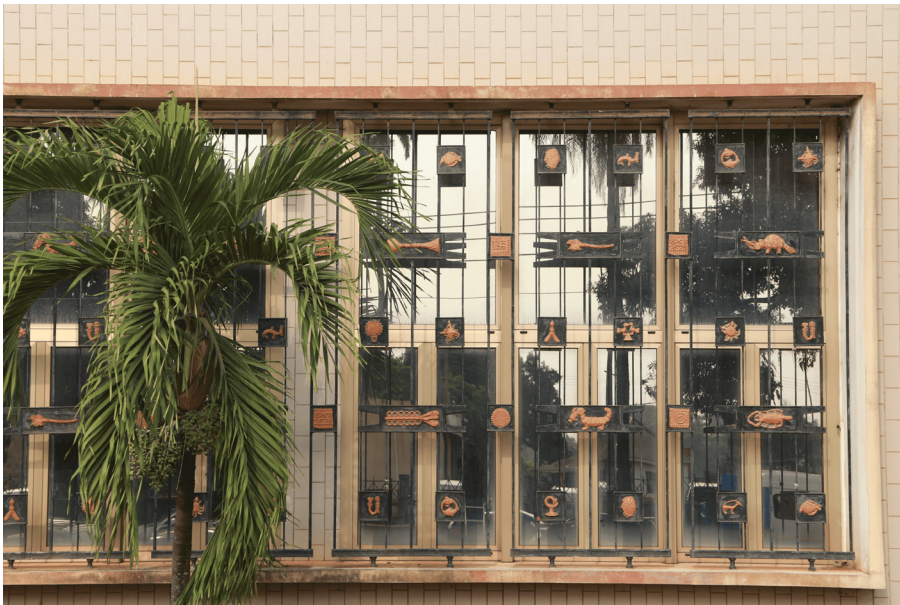
Figure 11: Details of ornamentation on the front façade of BoG Office, Kumasi showing the goldweight symbols casted in metal and finished in bronze colour