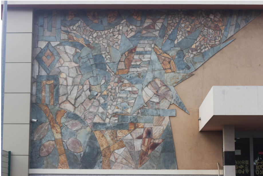
Figure 9: Stone Mural at the Bank of Ghana Complex that is made in stone tiles to explore the symbolisms on Cedi notes and Ghanaian traditional themes and discourses

sustenance of Ghana's economy. The crocodile symbolizes adaptability and resilience of the national economy. The star represents Ghana as the shining star of Africa, a symbol that is found on the coat of arms and many cedi note of the country.