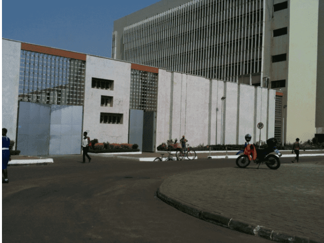
Figure 1: The five-storey Bank of Ghana modernist architecture located on the High Street, adjacent to the Accra Metropolitan Assembly (AMA) and Ghana Commercial Bank

The BoG building is credited with sumptuous applied ornamentation which evoke the African propensity for incorporating indigenous embellishing techniques in important buildings and places of communal interest (Prussin, 1974; Agboola and Zango, 2014).