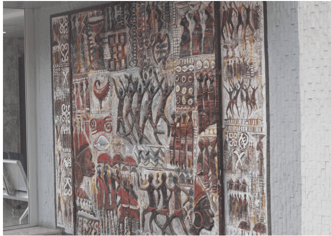
Figure 2: Mural in front of Bank of Ghana showing themes ranging from chieftaincy to wealth

Again, at the entrance leading to the banking hall is a mosaic ornamentation showing a chief in a palanquin adorned with gold relics and crown (figure 3). The golden linguist staff symbolizes wealth and authority, whereas the huge umbrella denotes the status of a high-ranking chief in the Ghanaian society. The deployment of colour symbolism; the use of gold, green and blue colours show a strong message of wealth. The gold, green and blue colours represent royalty and mineral wealth of the country. They also signify the country's rich forest resources, Ayiku (1998), Ghana High Commission in Australia, (n.d), and the rich resource of the sea and river bodies respectively. The chieftaincy imageries located at key locations of the BoG building is an evocative of the importance of the chieftaincy institution to the national economy, culture and political architecture of the country.