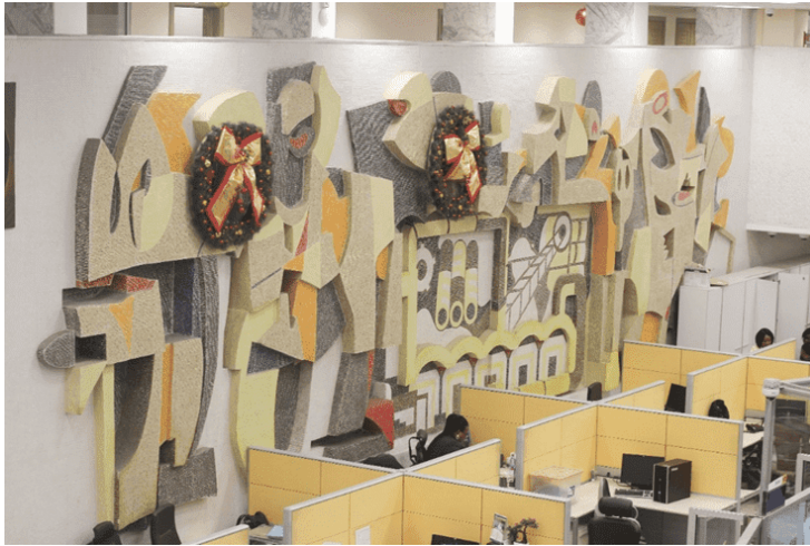
Figure 5: High Relief Mural Ornamenting the Banking Hall of BoG in Accra