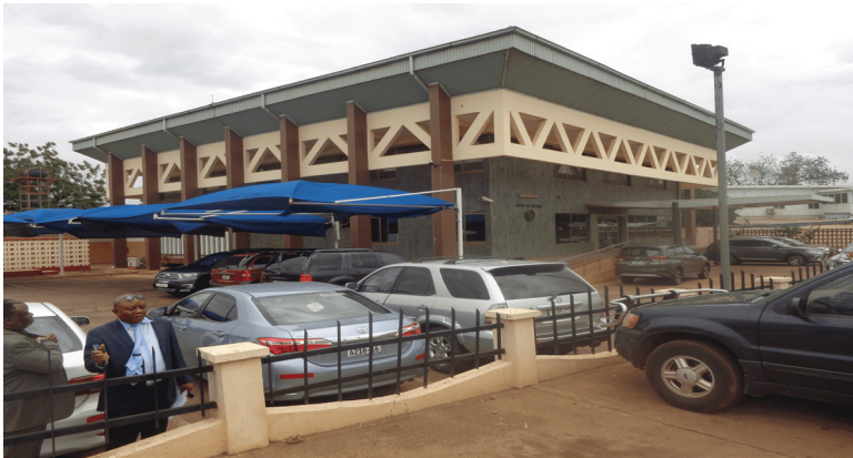
Figure 13: The BoG building in Tamale showing geometric concrete curtain wall hanging on the upper part of the building

the study argues that the indigenes clearly understand its meaning since it assumes a national symbol status, and is a notable source of Ghana's material wealth, serving invariably as currency in the Ghanaian society (Zekay, 2023).