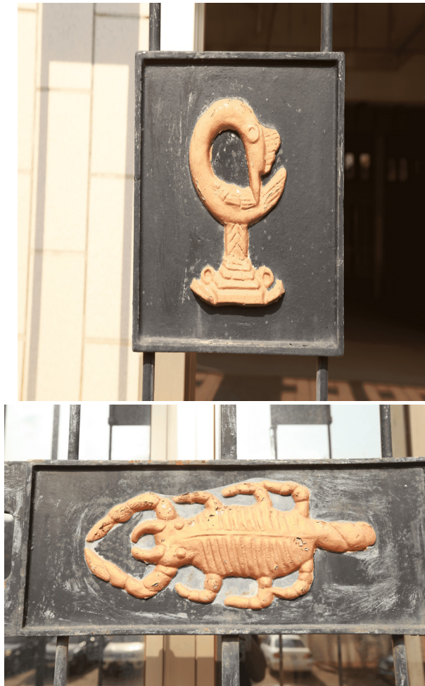
Figure 12: Details of ornamentation on the front façade of BoG Office, Kumasi showing the goldweight symbols casted in metal and finished in bronze colour