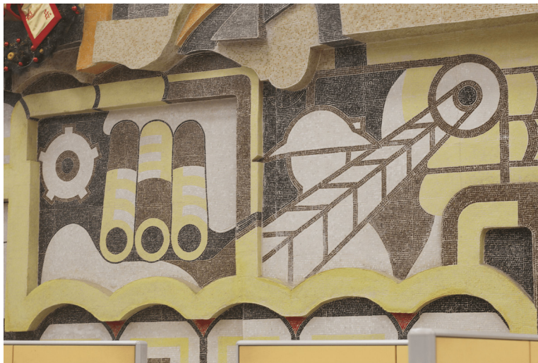
Figure 6: Details of High Relief Mural Ornamenting the Banking Hall of BoG in Accra

Again, on the top part of the banking hall, opposite the tellers are wood panel carved relief sculptures produced by Saka Acquaye (1923-2007), the renowned Ghanaian sculptor (Addokwei, 2007). These master pieces of wood carved relief sculptures depict business activities as well as chieftancy and cultural subjects (figure 7 and 8). The works explore themes that contextualize the history of trade engagement between the Gold Coast,