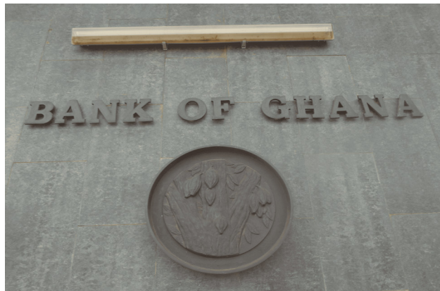
Figure 14: The plaque on the BoG building that alludes to the Cedi coin showing the cocoa tree with some fruits