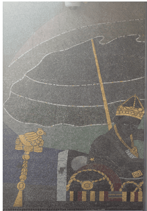
Figure 3: Mosaic mural showing rich culture and wealth

Again, at the entrance leading to the banking hall is a mosaic ornamentation showing a chief in a palanquin adorned with gold relics and crown (figure 3). The golden linguist staff symbolizes wealth and authority, whereas the huge umbrella denotes the status of a high-ranking chief in the Ghanaian society. The deployment of colour symbolism; the use of gold, green and blue colours show a strong message of wealth. The gold, green and blue colours represent royalty and mineral wealth of the country. They also signify the country's rich forest resources, Ayiku (1998), Ghana High Commission in Australia, (n.d), and the rich resource of the sea and river bodies respectively. The chieftaincy imageries located at key locations of the BoG building is an evocative of the importance of the chieftaincy institution to the national economy, culture and political architecture of the country.