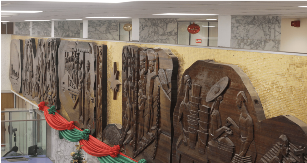
Figure 7: Relief sculpture exploring chieftaincy and some traditional economic activities; cocoa production, fishing, gold mining and trade, open air market trade narratives

evokes the essence of wealth in a banking environment (figure 8).