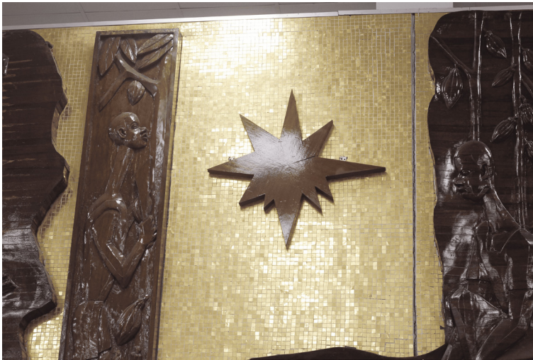
Figure 8: Details of relief sculpture superimposed over gold-lustered cladded mosaic wall