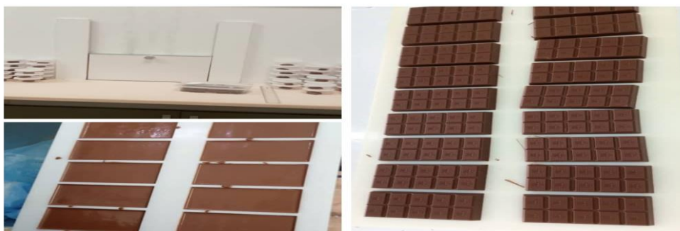
Figure 1: Molded and demolded okra pectin chocolate samples

Chocolate was produced by the method previously described by Datsomor et al. (2019) with some modifications. A 2500 g of milk chocolate was produced for each batch using the attrition ball mill (Wiener and co., Netherlands). The ingredients were weighed and milled in the attrition ball mill after which it was counched for 30 min. The mixture was drained, tempered at a temperature of 31°C and molded. They were then refrigerated, demolded and packaged (Figure 1).