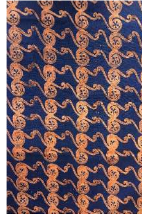
Fig. 34: Finished work of the wooden designed block dyed fabric

dition of ammonia solution to the freshly tapped latex, which helped to prevent the latex from coagulating for a time span of one month (Niyogi, 2007). From the last experiment conducted, it was realized that, the poly vinyl acetate which was added to the latex increased the viscosity of the latex to form the desired paste, this helped to prevent the latex from bleeding when applied to the fabric. It was realized that, the foam stamp used for applying the latex onto the fabric was able to absorb the resist paste, which gave ease to stamping and avoided bleeding off excess paste. From observations, the patterns of experiment 2 and 3 had a sharp edge appearance and did not create any crack effect as in the case of wax resist, after the removal of the paste. Lastly, it was easier and faster to de-latex the screen printed areas of the fabric since those areas had less paste there.