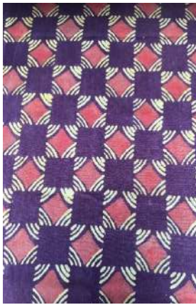
Fig. 32: Finished work of the dyed fabric, designed, and foam stamped