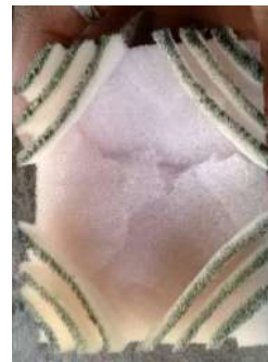
Fig. 25: A cut-out designed foam block