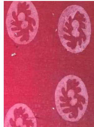
Fig. 11: The resultant effect after the dyed fabric, had been oxidized, dried and washed