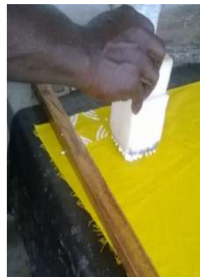
Fig. 31: Paste, stamped onto the dyed fabric

3 tablespoons of Sodium hydrosulfide and 3 tablespoons of sodium hydroxide. These recipe components were mixed by first dissolving the dye and hydrous in warm water to prevent lump formation and the caustic soda, dissolved in cold water due to its volatile nature when it comes into contact with warm water.