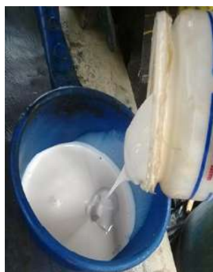
Fig. 7: Poly vinyl acetate added to the mixture of Natural rubber latex and ammonia solution