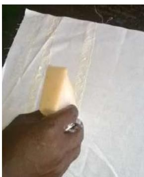
Fig. 15: Applying the paste onto the fabric using a foam stamp

Haven successfully completed the above experiments, the researchers proceeded to address the possibility of using it in commercial quantity for the main project of producing 9 metres batik fabric using the natural latex. This involved the actualization of the design concept for the batik clothes to be produced. Per the experiment, dye recipes were formulated, fabrics were prepared, and a series of textiles designing stages such as motif development, layout, arrangement and colouring were made using geometric shapes derived from either the Adinkra symbols or from nature. The resist rubber latex paste were formulated, dyebaths prepared and the procedure for printing via designed foam and wooden stamp block, screen printing (as in Figs. 23, 24 and 25) and dyeing through table dyeing and dyeing by immersion were all planned before the commencement of the entire batik production.