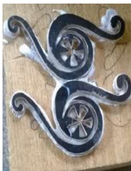
Fig. 23: Wooden stamp made out of plywood and solid wood