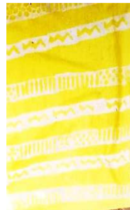
Fig. 22: De-latex fabric

With the Photoshop software, motif arrangements in a repetitive pattern were made to create an orderly design arrangement. The colours were carefully chosen to help predict the sequence of the dyeing process and how the end product would be. The illustrations below attest to the laid out design plan utilized (Figs. 26, 27 and 28).