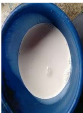
Fig. 6: Mixture of natural latex rubber with ammonia

In using the screen to transfer the paste onto the fabric, the ends of the first dyed fabric were securely stapled onto the working table, and a prepared textured screen design was placed on the fabric. A small quantity of the latex paste was poured into the reservoir at one end of the screen, and with the help of a squeegee, the paste, gently and sparingly spread with an even pressure for proper registration over the design created by the first colour print on the fabric (Fig. 11).