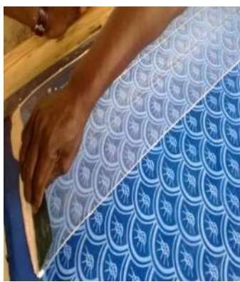
Fig. 30: Paste, screened onto the fabric