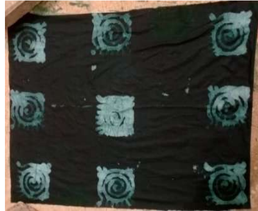
Fig. 3: Drying of the dyed fabric