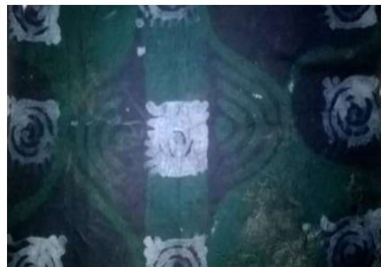
Fig. 5: The finished work

dye solution but this time, using the violet colour dye. The fabric was immersed in the dye-bath for 5 minutes, removed and dried for oxidation as before. After oxidation, the rubber latex was removed from the fabric, however, unlike the wax method, where hot water or hot