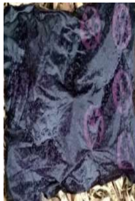
Fig. 13: Oxidizing of the dyed fabric