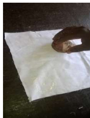
Fig. 8: Applying the latex paste onto the fabric