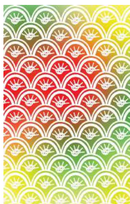
Fig. 27: Laid out design pattern 2