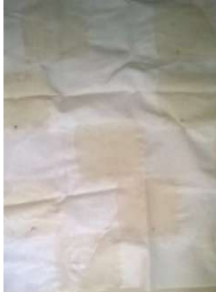
Fig. 2: Stamped fabric with the Natural rubber latex