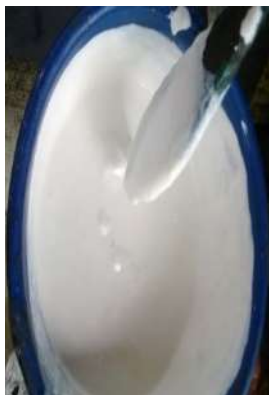
Fig. 29: Desired paste consistency