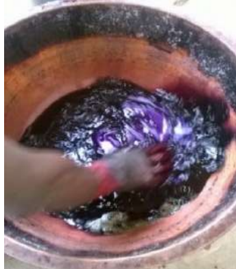
Fig. 18: Dyeing the resisted fabric