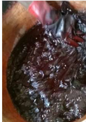
Fig. 10: The resisted fabric immersed into the dye bath