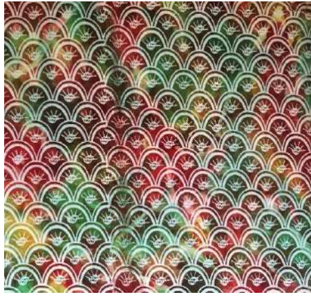
Fig. 33: Finished work of the screened designed dyed fabric