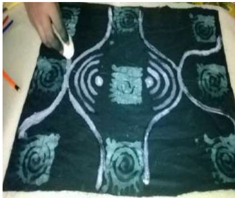
Fig. 4: Application of the Natural rubber latex on the fabric with an improvised tool