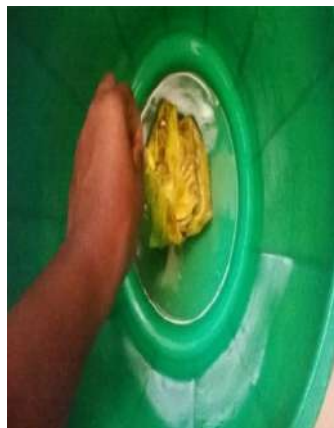
Fig. 21: Removing the latex from the fabric