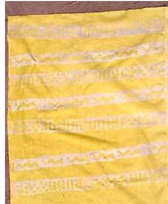
Fig. 19: Drying the dyed fabric