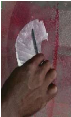
Fig. 9: Spreading the latex paste onto the fabric with a squeegee