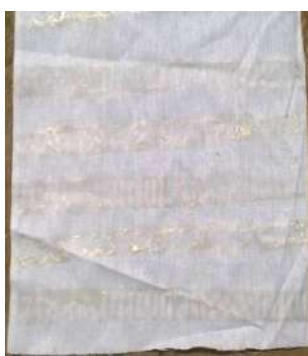
Fig. 16: Drying the resist fabric