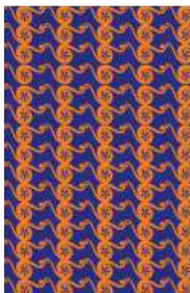
Fig. 26: Laid out design pattern 1