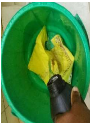
Fig. 20: Turpentine being poured onto the fabric