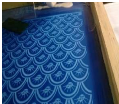
Fig. 24: A developed lacquered silk screen