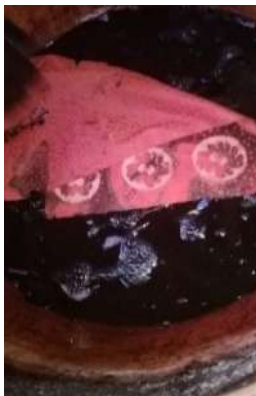
Fig. 12: Fabric immersed into the dye bath