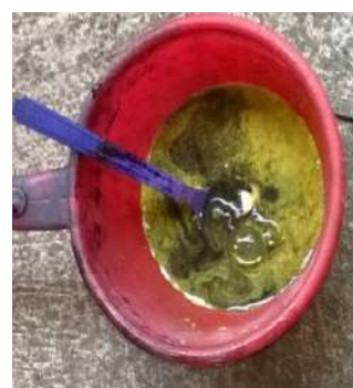
Fig. 17: Prepared leuco compound of yellow dye