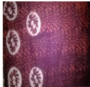
Fig. 14: Drying the de-latex fabric

After printing, the screen was carefully removed from the printed fabric, and left to dry. The last colour being the violet dye solution (Fig. 12) was prepared using the same recipe prepared as the dye solution of the first experiment. The resisted fabric was then immersed in the dye bath for five minutes, then removed and dried for oxidation (Fig. 13). The resisted dyed fabric was de-latex by pouring 250 millilitres