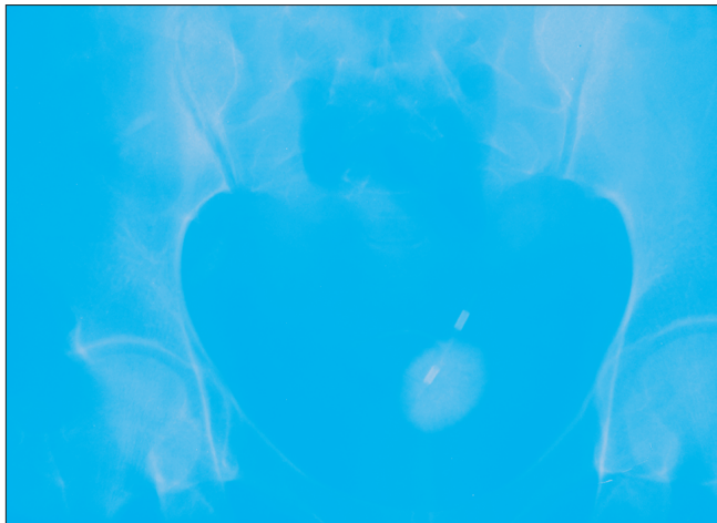
Figure 1: Pelvic X-ray showing bladder stone with embedded Copper T intrauterine contraceptive device