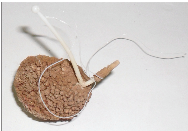
Figure 2: Extracted stone with intrauterine contraceptive device

formation around it is one of the rarest complications of IUCD. [2-4]