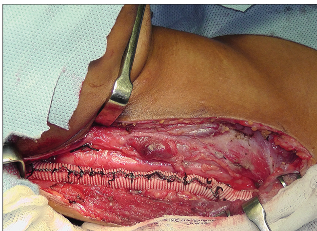
Figure 3: Right internal jugular vein wrapped in an 8-mm PTFE tube graft

Care was taken to prevent inadvertent damage to the jugular vein or the contents of the carotid sheath. This reinforcement prevented the vein from dilating and at the same time preserved its function.