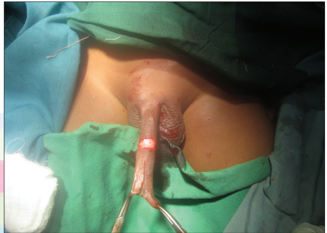
Figure 4: Crushed prepuce dorsally