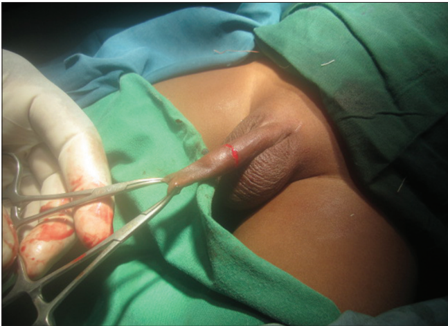
Figure 3: Circumferential knife skin mark