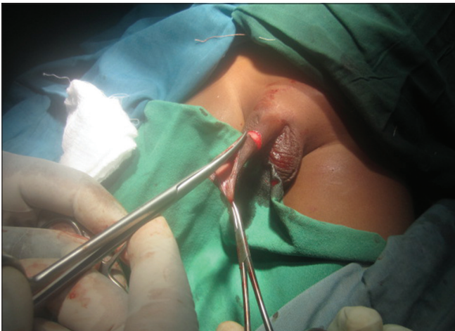
Figure 5: Dorsal slit