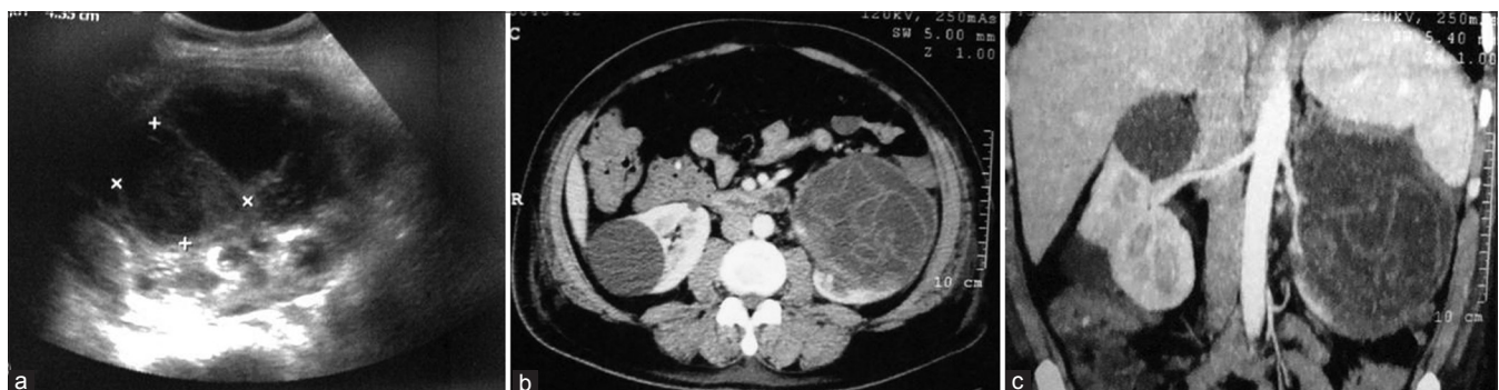
Figure 1: (a) USG showing multilocular hydatid cyst. (b and c) CECT showing left renal hydatid with multiple daughter cysts