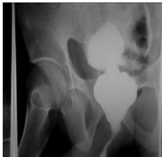
Figure 2: Micturating cystourethrogram (MCUG) showing huge prostatic cavity

The stone in this patient is vesicourethral (Young type IV, Jolly type a) De novo urethral stones are generally composed of magnesium ammonium phosphate (struvite). [5] In contrast, migratory stones are often composed of calcium phosphate or calcium oxalate. The composition of the stone in our patient is magnesium ammonium phosphate. The possible etiological factors can be urethral stricture, stasis, or stagnation, with urinary infection, foreign bodies, debris, bladder neck obstruction, idiopathic factors, lithogenic diathesis, and schistosomiasis. [6] Less than 20 cases of giant prostatic urethral calculi have been reported