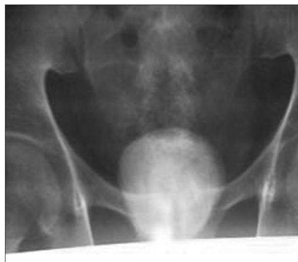
Figure 1: Plain pelvic X-ray showing prostatic urethral calculus

He was resuscitated with intravenous fluids and antibiotics