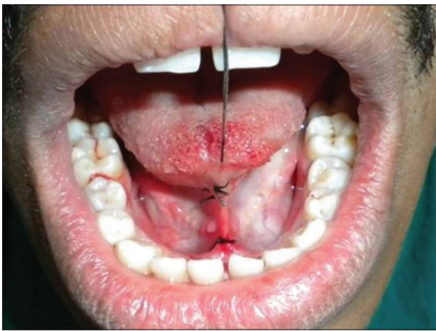
Figure 3: Two vertical rows of suture parallel to each other (Case 2)