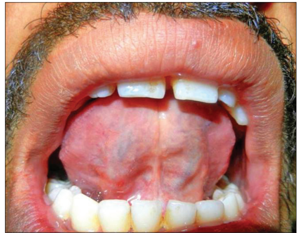
Figure 8: Follow-up after 2 years (Case 2)