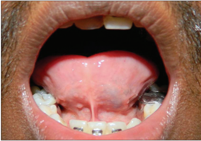
Figure 1: Preoperative view – Class II ankyloglossia (Case 1)