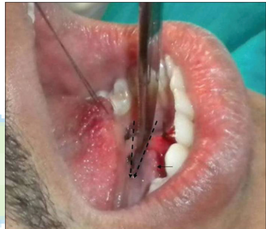
Figure 4: Line of incisions (dotted lines) (Case 2)