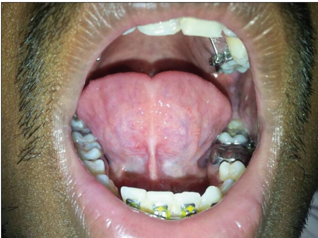
Figure 11: Follow-up after 2 years (Case 1)