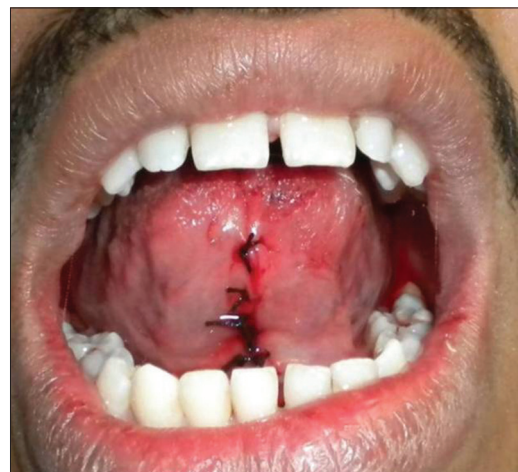
Figure 6: Immediate postoperative view (Case 2)

and avoidance of any hot, hard or spicy food stuff. The postoperatively tongue exercise included touching of tongue to the palatine rugae while keeping mouth opened, rolling tongue side to side touching corner of the mouth,