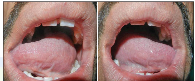
Figure 10: Tongue position on left and right lateral movement after 2 years (Case 2)

Thus, this technique provides promising result in management of severe ankyloglossia with just suturing prior to lingual frenectomy. However, to confirm the potential of this surgical technique long term interventional randomized clinical trial need to be carried out.