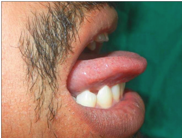
Figure 9: Tongue position after protrusion after 2 years (Case 2)