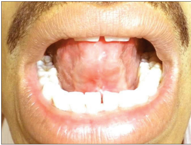
Figure 7: Postoperative 1-week view (Case 2)