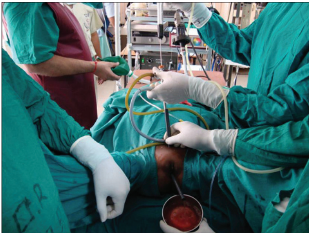
Figure 1: Twin Amplatz in situ , the one above as a working channel and the other in the urethra as an outlet

them to come out of the urethral Amplatz. Only a few fragments were picked up by forceps passed through the nephroscope in an antegrade manner. In the end, a Foley catheter was placed through the suprapubic tract which was removed after 48 hours. The patients were then followed up after one month, three months, and then yearly.