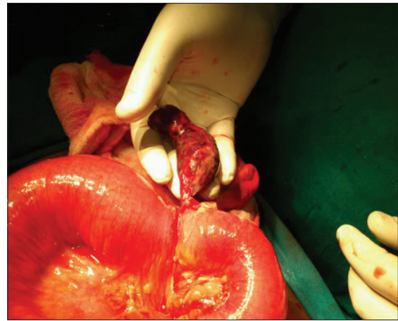
Figure 2: Gangrenous Meckel's diverticulum causing obstruction of small bowel (after releasing the peritoneal band causing obstruction)

The varied clinical presentation of MD makes preoperative diagnosis often difficult, with only 6-12% of cases being diagnosed correctly. [10] Most of the cases are misdiagnosed as acute appendicitis. Computed tomography scans and sonograms may aid in the diagnosis of such uncommon pathology and should be considered in cases of intestinal obstruction with no clear etiology. The use of Tc 99-m pertechnetate or Tc 99-m sulfur colloid is primarily for investigating gastrointestinal bleeding and may not