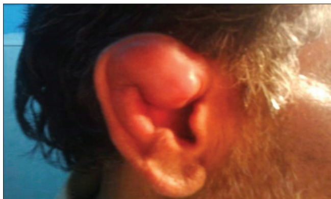
Figure 5: Pseudocyst predominantly involving triangular fossa