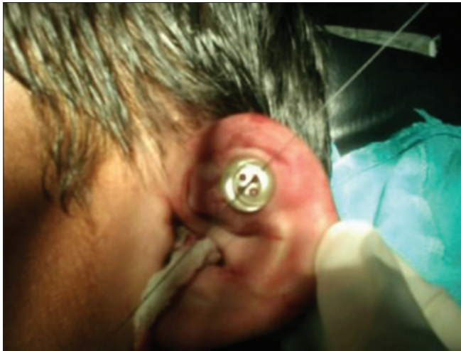
Figure 3: Buttons being tied to pseudocyst