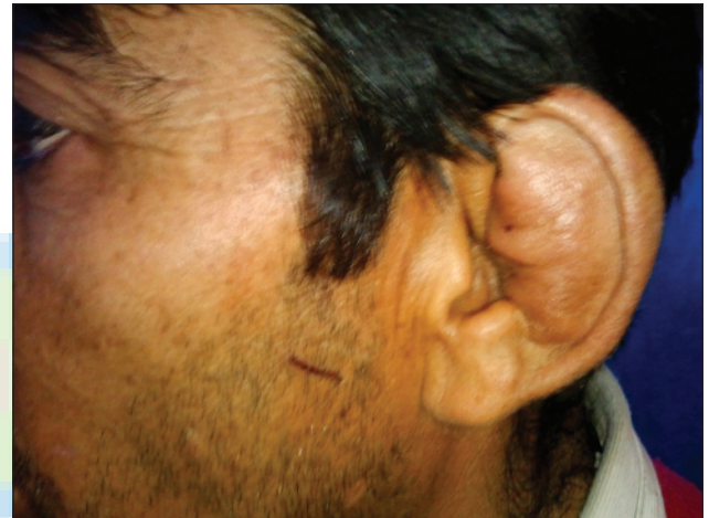
Figure 4: Pseudocyst involving antihelix, triangular fossa, and scaphoid fossa