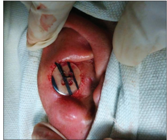
Figure 2: Buttons tied to pseudocyst