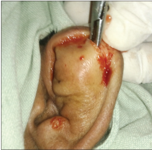
Figure 1: Incision over the pseudocyst