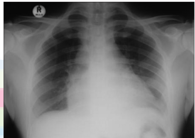
Figure 2: Chest radiograph post endoscopy