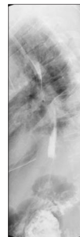
Figure 3: Barium swallow post pericardial drainage

nature of the clinical features and a high mortality rate may be the consequence of delayed treatment. [9] This case emphasizes the importance of being well acquainted with the potential complications of invasive procedures. A high