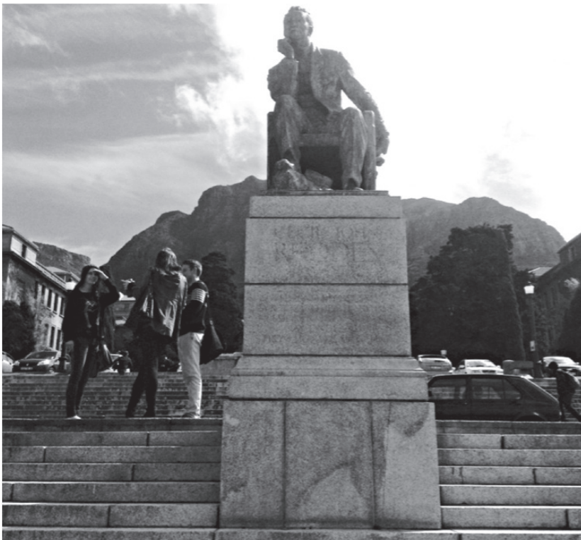
Power and internalised inferiority (Sean)

The following photo-story about the statue of British mining magnate and colonialist Cecil John Rhodes (who ‘donated’ the piece of land on which UCT is built) that previously stood high in the centre of upper campus 8 captures many of these ideas.