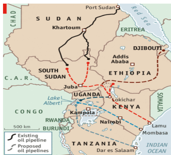
Figure 2. Existing and proposed oil pipelines

Increasing the technical expertise of African oil companies would reduce the competitive advantage of foreign multinationals and their dangerous attempts to circumvent state control on oil exploitations, even through corrupt practices. Social transactions (compromises and agreements with different stakeholders, including local populations) are also needed to minimize conflicts: local content policies are useful frameworks to encourage these mechanisms of collaboration. 28 The conflicts, vulnerability, and risks related to oil exploitation also explain price volatility, engendered by the real or imaginary fear that there