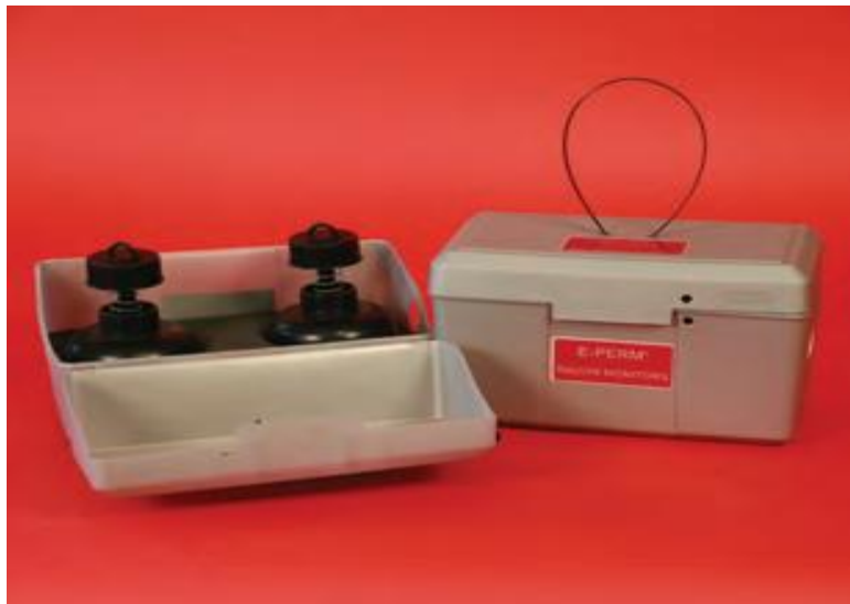
Figure 1: E-PERM™ Chambers in Tamper resistant box with spring loaded top open.

the stipulated time period. It is powered by a 9V battery and holds the reading for about 4 minutes before shutting off.