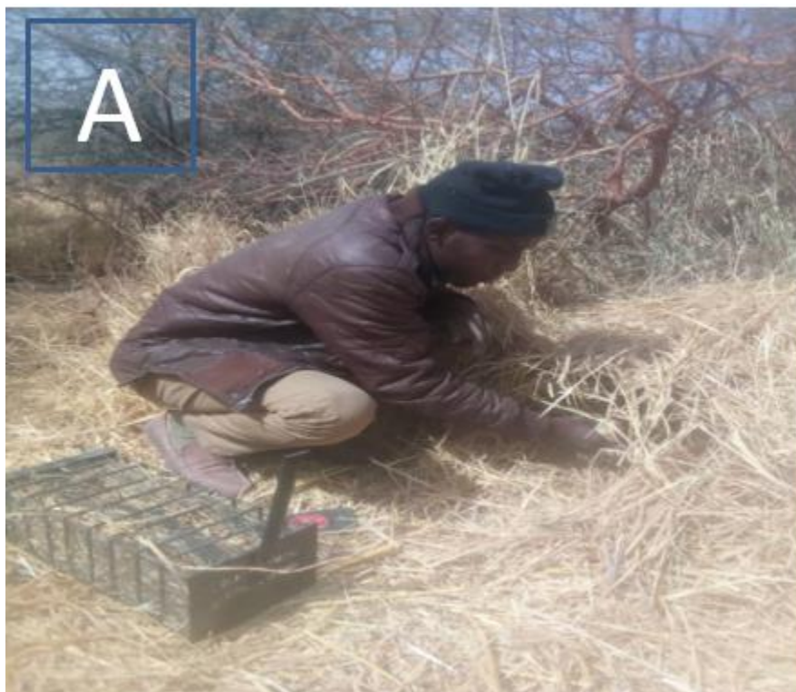
Plate A: Researcher Setting a Trap during Field Work in the Study Area