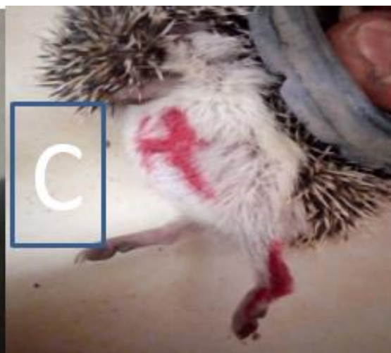
Plate C: Captured Hedgehog) and Marked