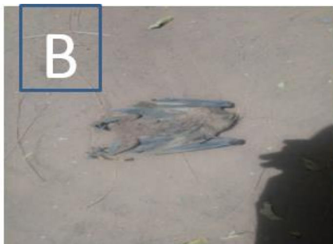
Plate B: Dead body of Eidolon helvum