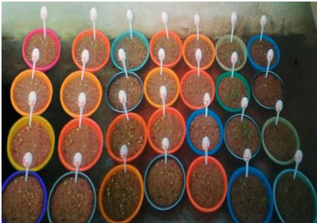
Figure 1: Experimental layout of the study with emerging Albizia lebbek seedlings.

The variables evaluations were carried out using the formula by ISTA, (1997) and formula by Nadjafi et al , (2006). Data were also collected at peak period of germination (PPG) (Time of highest number of germination), complete dormancy period (CDP) (count of days from seed sowing to the commencement of germination), and peak germination percentage (PGP)