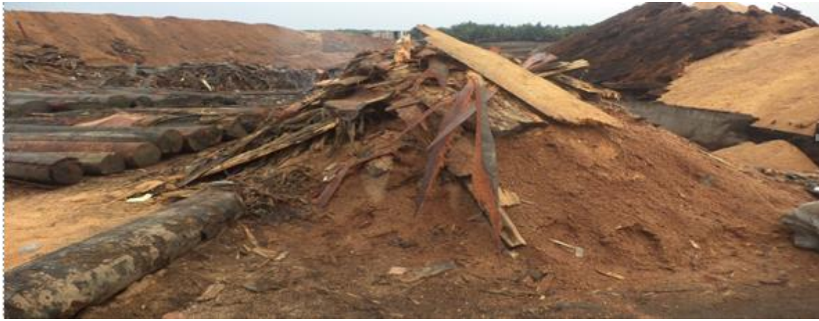
Plate 1: Heaps of wood residues, mainly comprising of wood slabs, barks and sawdust, at Dagogo sawmill, located among the Illabuchi cluster of sawmills

At the background, in Plate 1, are some debarked logs awaiting conversion in the sawmill