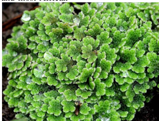
Plate 2: Azolla filiculoides growing inside water

countries. This fern often forms very thick mats on most slow-moving water bodies thereby causing economic losses to natives who rely on those waters (McConnachie et al. , 2003).