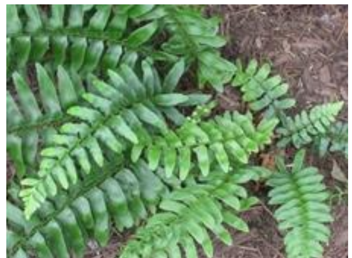
Plate 7: Polystichum acrostichoides growing on forest floor

Polystichum acrostichoides (Plate 7), a native of North America, has been regarded as an invasive fern species across primary forests in Central New York, USA. This fern is usually green throughout the year and is found in varieties of habitats such as woodlands, shady forests, banks of streams and slopes (Linn, 2006).