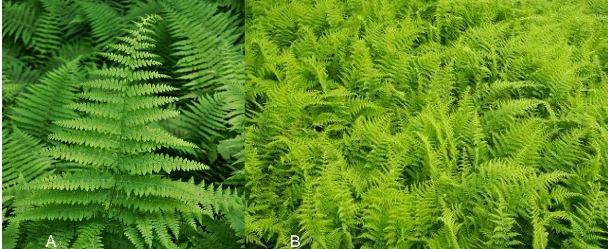
Plate 3: Dennstaedtia punctilobula (A) at close range (B) as an invasive fern

seedlings hardly survive under the canopies of this fern. Therefore, it has been described as an aggressive invasive fern due to its rapid spread (Hill and Silander, 2001). This fern was also found colonizing forests and roadsides in New England (Hammen, 1993).