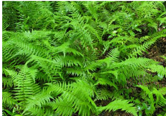
Plate 12: Thelypteris noveboracensis growing as invader

New York fern (Plate 12) is another well-known fern species in USA for its ability to disturb the regeneration of forests vegetations (Hill and Silander, 2001). This fern is very abundant, occupying the understory of secondary forests in Connecticut, USA.