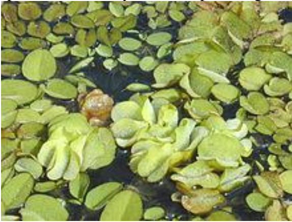
Plate 10: Salvinia molesta growing on water surface

Salvinia molesta (Plate 10), a native of Brazil is an aggressive invasive fern species in Italy. It has spread to virtually most tropical regions of the