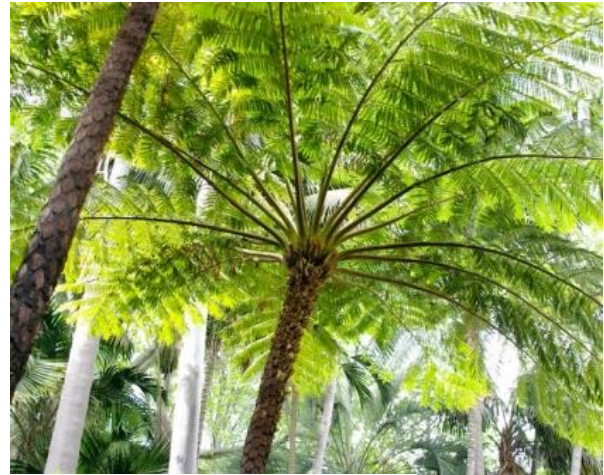
Plate 11: Sphaeropteris cooperi

world. S. molesta , usually grows to the extent of covering water surfaces within a short period of time (Giardini, 2004).