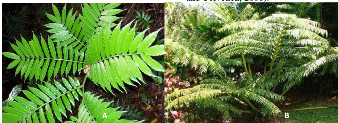
Plate 1: Angiopteris evecta growing (A) growing on the forest floor (B) as ornamental plant

Angiopteris evecta (Plate 1) has been listed among invasive ferns in regions such as Costa Rica, Jamaica and Hawaii (all in North America) where it has disrupted the native biodiversities (Christenhusz and Toivonen, 2008).