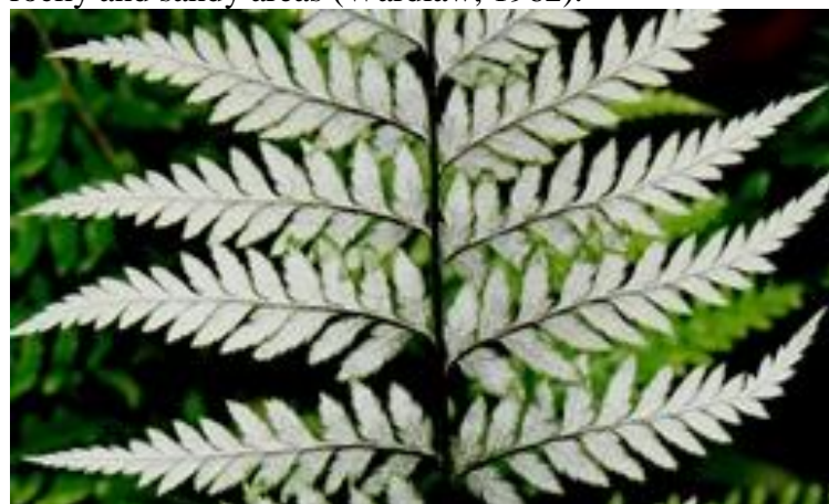
Plate 6: Pityrogramma calomelanos showing its whitish leaflets

Pityrogramma calomelanos (Plate 6) has been identified as a troublesome plant invading most oil palm plantations that were established in Cameroon (Africa). The invasion of the fern was as a result of application of arsenical herbicide on a leguminous weed Pueraria phaseoloides in order to establish oil palm. The fern therefore took over and became very difficult to control. The fern mainly undergoes sexual reproduction in the wet season, but has the potential to survive long period of dryness in most rocky and sandy areas (Wardlaw, 1962).