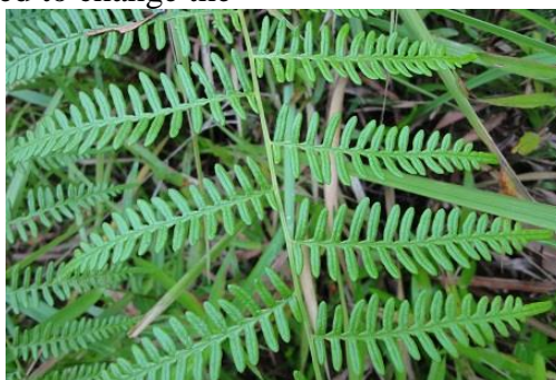
Plate 9: Pteridium arachnoideum

vegetation structure of the area. The areas invaded by this fern was found to have lower diversities and densities thereby indicating its threat on the future biodiversity of this area (Miatto et al. , 2011).