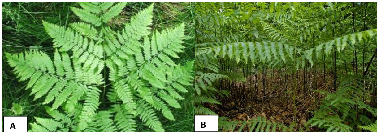
Plate 8: Pteridium aquilinum [A] at close range, [B] as invasive on forest floor

This fern also has the potential of resisting diseases and releasing allelopathic substances limiting the growth of neighboring plants (Marrs et al. , 2000; Alonso-Amelot and Avendano, 2002). Furthermore, its ability to adapt to broad range of environmental conditions and disasters such as fires made it a successful invader (Page, 1986). This fern has successfully invaded Southern Yucata for decades and the areas invaded have outgrown cultivated areas (Schneider, 2006). Its invasion in most regrowth forests has been aided by frequent fires and land clearance for farming. Therefore, its potential to get out of control thereby forming monospecific colonies which threatens native biodiversity makes it best described as invasive fern species (Schneider and Fernando, 2010).