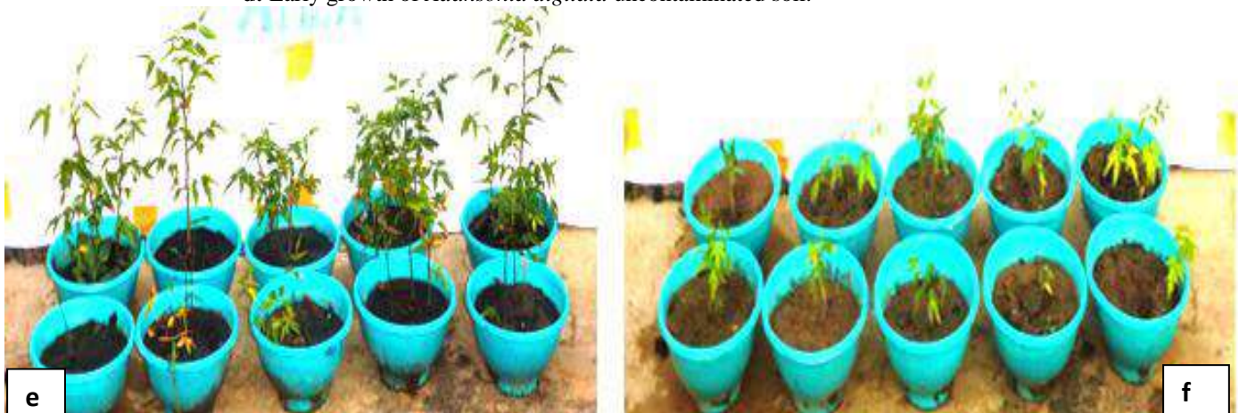
Plates e: Early growth of Azadirchta indica (neem) on uncontaminated soil. f: Early growth of Azadirchta indica on contaminated soil.