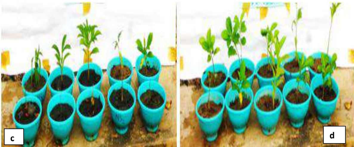
Plates c: Early growth of Adansonia digitata on contaminated soil d: Early growth of Adansonia digitata on uncontaminated soil.