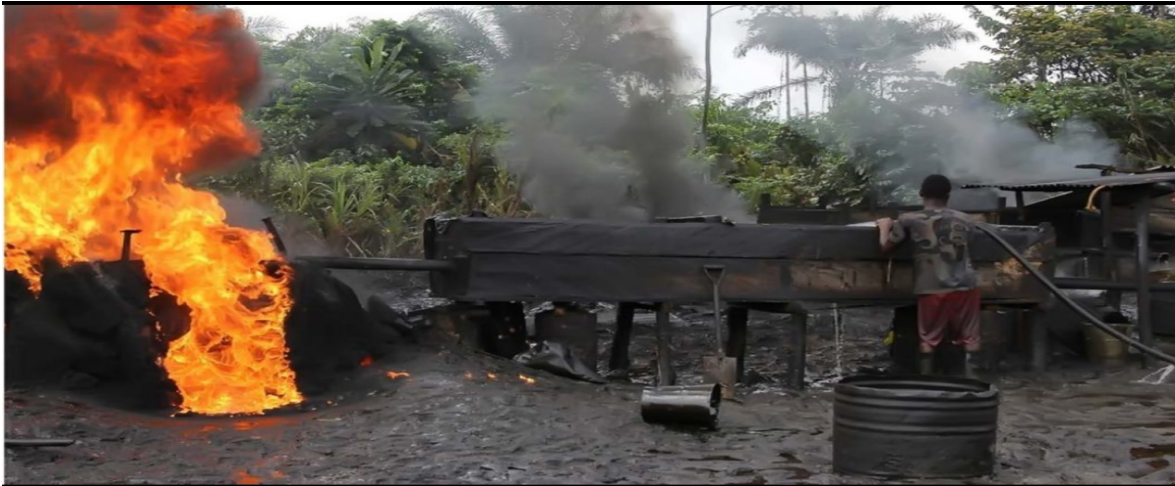
THE POT AND COOLER