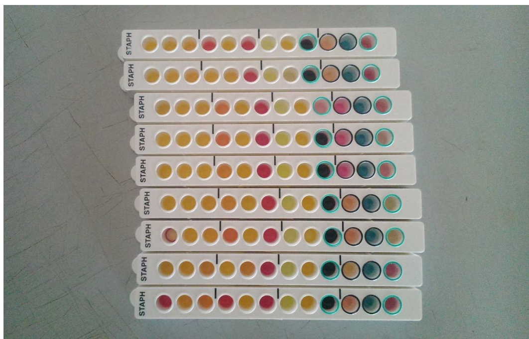
Figure 1: Digital image of the Rapid test reactions for identification of S. aureus

Nasal carriage of Staphylococci is the predominant mode of carriage in about 20-80% of the population [26,27]. However, in this study, of the 217 urine samples taken, Staphylococci isolates were recovered from 171 (78.8%). Since only 73 were identified to be Staphylococcus aureus and 71 as MRSA, their prevalence in the sample population is 33.6% and 32.7% respectively. The conventional cultural method of identifying Staphylococcus aureus gave a higher figure of 135 (78.9%) out of 171 isolates (Fig. 2).