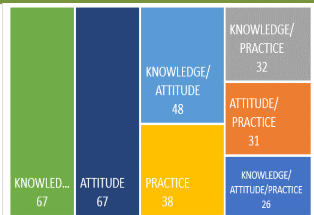
Figure 1: Response matrix for knowledge attitude and practice

Our findings suggests that doctors and the medical laboratory scientists in the public health space have better knowledge of pharmacovigilance (75% and 70% respectively) than the pharmacists (61%). Also, doctors showed better practice than pharmacists (50% and 31% respectively). This may need to be further investigated as the relative number of responders of these professionals differed markedly. Overall, there was only 26% adequate knowledge/attitude/practice and 32% adequate knowledge/practice. This suggests a fair overall knowledge of pharmacovigilance but inadequate practice levels.