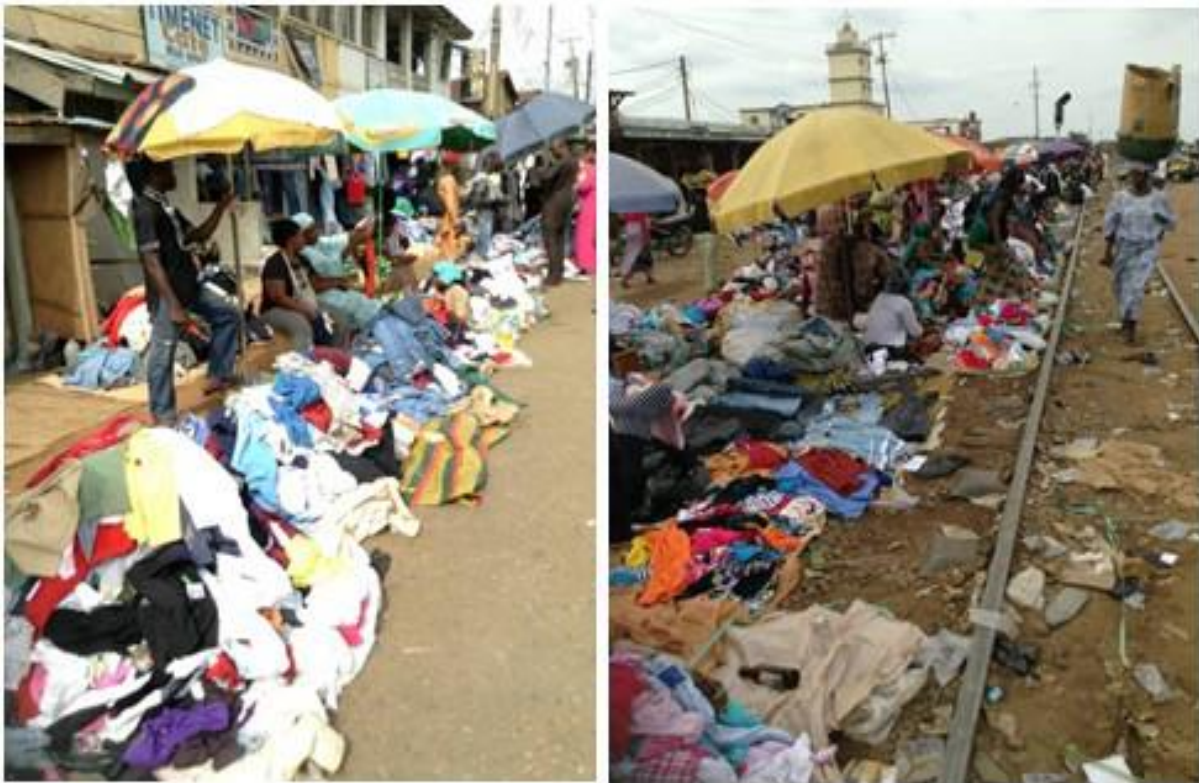
Figure 2: Pictures Showing Second Hand Clothes Market in Some Locations in Nigeria