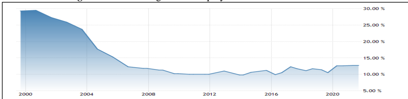
Fig.3. evolution of Algeria's unemployment rate from 2000 to 2022