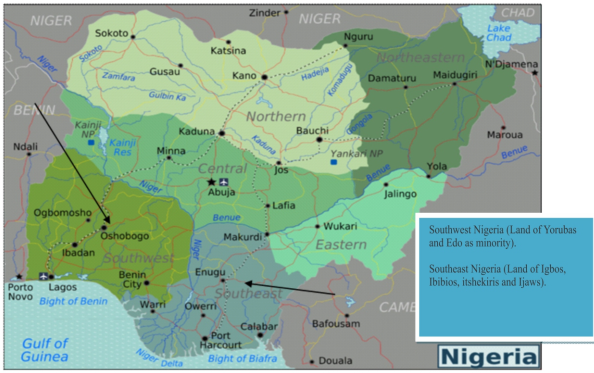
Figure 1: Nigeria Map indicating regions where consumption of Alcoholic bitters is rampant. The alcohol is majorly consumed in the southern region due to the industrialization of the areas and lack of strict cultural and religious beliefs that forbid alcohol consumption

Njoku, 16 paid visit to some of these alcoholic industries; and found that they have very well planned market strategies that are being put in place to ensure effective marketing and distribution. It was discovered that false addresses were written on labels of products from some of the acclaimed factories and on interviewing the staff they gave little or no response to the questions. This means some alcoholic bitters are still illicitly produced in obscure locations. Nzegwu et al. 9 reported that alcoholic bitters are sold without any restriction in public bus stations in Edo, Lagos and Ogun states and other southern Nigeria regions. A study conducted by Nzegwu et al. 9 in Benin, Edo State, reported that the percentage alcohol involvement in road traffic accident morbidity and mortality rate was 23.32 %. Ebirim et al. 10 also conducted a survey on prevalence of alcohol use among students in Owerri, a south-eastern part of Nigeria and concluded that 78.4 % of the 482 subjects confirmed that they are current users, with twenty-seven percent of them being heavy drinkers (i.e drink more than 4 bottles per day). Previous