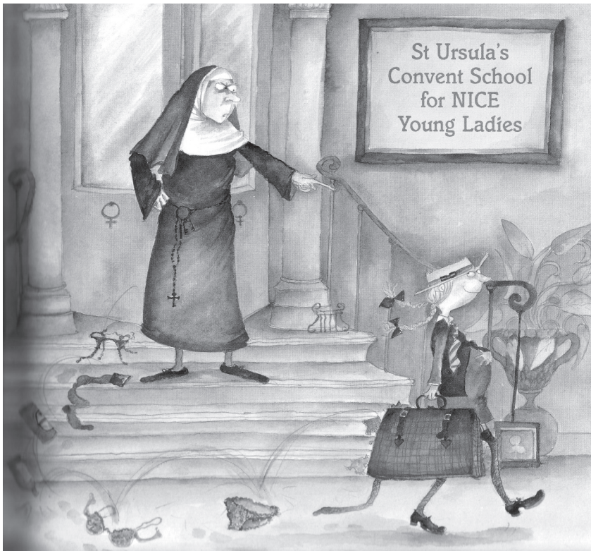
Figure 2: from Mummy Never Told Me by Babette Cole

Another brainstorming activity undertaken by small groups of third-year students in 2005 focused on picture books such as Mummy Never Told Me , The Pet Shop , Beegu , What on Earth...? , Not So Fast , Songololo and a few others. The students studied the texts and reported back on the impact of the pictures as well as themes arising from the books that could be used as focus points for learning in the Intermediate Phase classroom. Babette Cole's Mummy Never Told Me is about a young child wondering why her mother never told her anything about why certain people did certain things. Some of these things include what her parents get up to behind their locked bedroom door or when disporting themselves on the beach at night and why her mother insists that she goes to school when, as a schoolgirl, she was expelled from hers. The complementary nature of words and pictures is demonstrated with this last point – the words make no reference to why the mother was expelled, but the picture shows a schoolgirl in uniform with a noticeably rounded stomach (Figure 2).