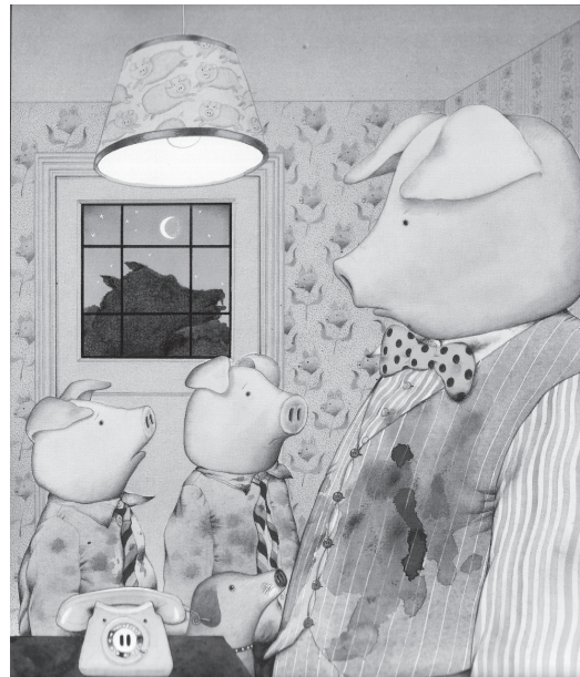
Figure 1: from Piggybook by Anthony Browne

An aspect of picture books well worth exploring in relation to ways in which meaning comes about is that of the recurring motif in illustrations. Anthony Browne provides interesting examples of this in works such as Piggybook and Gorilla . In Piggybook almost unnoticeable pictorial details in the background such as the tiny pattern on wallpaper begin to change in keeping with events as they unfold. In this story, a woman is treated like a ‘doormat’ by her husband and two sons who are filled with their own importance, until one day she disappears from home, leaving a message that they are all “pigs”. As the father and sons try to cope on their own, details of their surroundings change. The tiny flowers on the wallpaper have now become pig heads, a pattern that is replicated on various items such as lampshades. Far more obvious is the transformation of the male characters themselves into pigs (Figure 1).