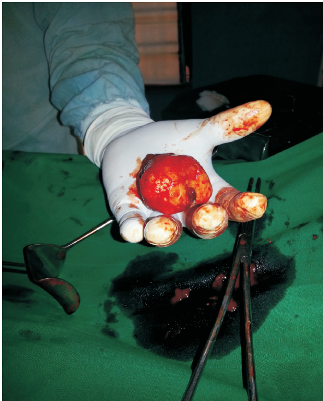
Figure 2: Bladder stone, post op