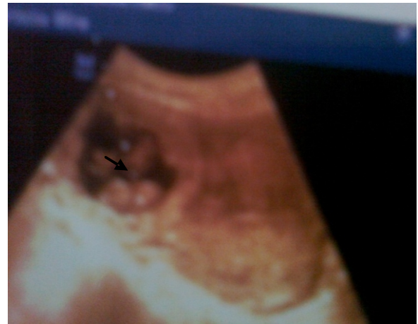
Figure 1: Ultrasound scan demonstrating cornual monoamniotic twin gestation. Note the empty uterus.