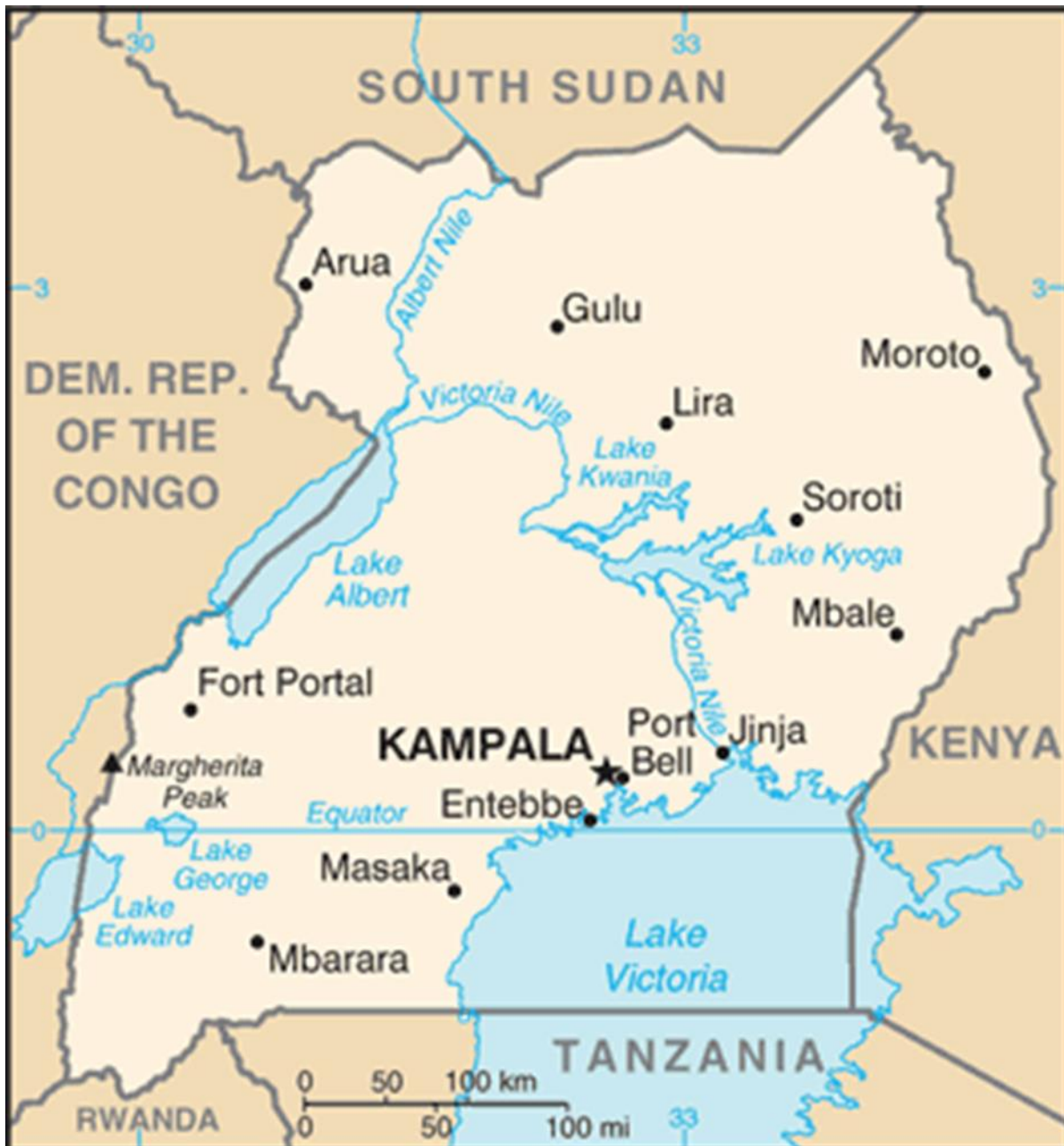
Figure 1: The map of Uganda showing the location of Mbarara District