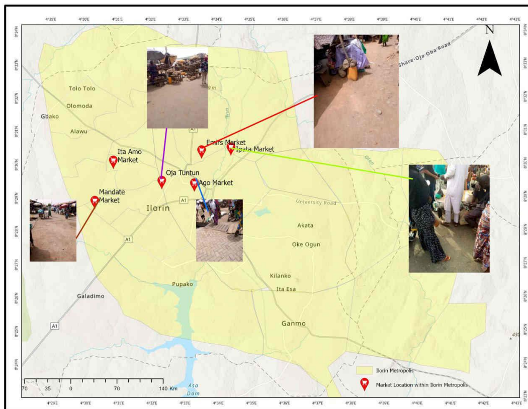
Figure 1: Ilorin Metropolis Showing Major Markets

The study area was Ilorin, the capital of Kwara State, located between latitudes 8^{\circ} 30' and 8^{\circ} 50' N, and longitudes 4^{\circ} 20' and 4^{\circ} 35' E (Adediji, Ajayi & Olawole, 2009; Usman et al., 2015). The city spreads across parts of local government areas of Ilorin East, Ilorin West and Ilorin South (Figure 1).