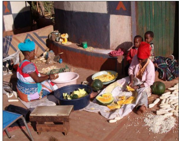
Photo 1: Mother and daughter preparing mealies (lefela) and watermelon (morotse) for the evening meal

[Maize ( lefela ) ( zea mays ), marôgô/theepe ( amaranthus thumbergii ), a variety of pumpkin types (int. al. cucurbita pepo and lagenaria siceraria – the bottle calabash, known in the vernacular as legapa ), watermelons ( morôtsê ) ( citrillus vulgaris ) and beans ( dinawa ) ( vigna subterranea ) form the staple diet of the Hananwa during the dry winter season, as is the case among the majority of other indigenous groups living in rural areas with a similar climate. All of these foods are grown and harvested during the rainy season; and maize, marôgô , grain sorghum ( sorghum bicolor ) and beans are stored for the winter months. The community members cultivate beans ( dinawa ), especially jugo beans ( vigna subterranean ). The