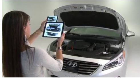
Fig.1. Hyundai AR Manual Application

Automotive industry amongst other industry has also begun using AR as a new marketing strategy for their product (Smith, 2009). Volkswagen was the first to introduced AR marketing campaign by AR using tracker technology in 2008. Volkswagen also created an AR campaign for Golf model where people can see an augmented reality version of Golf via their website in 2010. At Geneva Auto show in 2012, Volvo gave user the opportunity to see the inside of Volvo V40, a newly launched model. Using tablet, the app used 2d marker to emulate 3d images augmented reality experience.