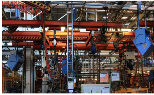
Fig.3. SAR prototype at GM HVO

Re'Flekt collaborated with Bosch and developed a live-diagnosis AR application called "Bosch Flex-Inspect", and was presented at the 2014 NADA Auto Show in New Orleans (Re-Flekt, 2014). This application were directly linked to Bosch-developed cloud-based diagnosis system called "Flex-Inspect" which was inspired from a real working situation. The app enabled existing data from car system sensor such as battery voltage and tire air pressure analyzed and presented in layers' image on the tablet. For automotive inspection, there are limited literatures that reviews on AR for inspection since most AR app are still under development and not commercially used due to high cost for commercial implementation.