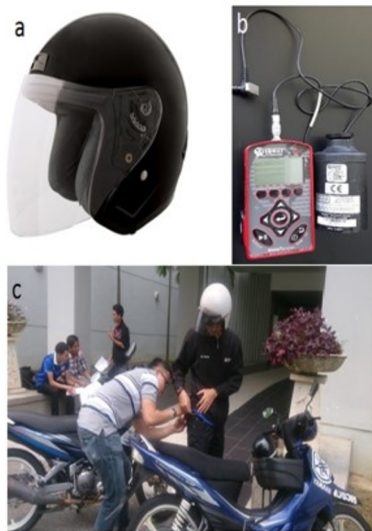
Fig.1. Instruments used for field study: (a) Open-face helmet; (b) Dosimeter and calibrator; (c) Dosimeter installation on the rider

On their arrival, dosimeter data was saved as session number followed by turning it off and uninstallation of the instrument from the rider. Raw data was later transferred to computer software i.e. 3M Detection Management Software (DMS) to deliver the measurement of each session's report. Data measurement included: Start and stop time, device serial number, device model type, average A-weighted sound level ( L_{Aeq} ), the exchange rate at 5, dose (daily personal noise exposure), TWA (time-weighted average), SEL (sound exposure level).