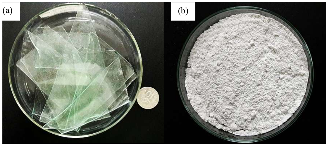
Fig.1. AWG1 sample (a) as received (b) in powder form after grinding

The waste glass was collected from the two different glass industry in Malaysia. There are labelled as WG1 and WG2. WG1 is a type of safety glass which formed in laminated and tempered glass with the flat shape. While, WG2 is a type of processed glass in a cullet form to be supply as material in the glass industries. The received of the cullet glass are in angular shape and elongated particles. The waste glass, WG1 and WG2 are shown as in Fig. 1 and Fig. 2 respectively. Both waste glasses were crushed and milled using mortar grinder (Retsch RM100, Germany) for 2 hours to form a glass powder.