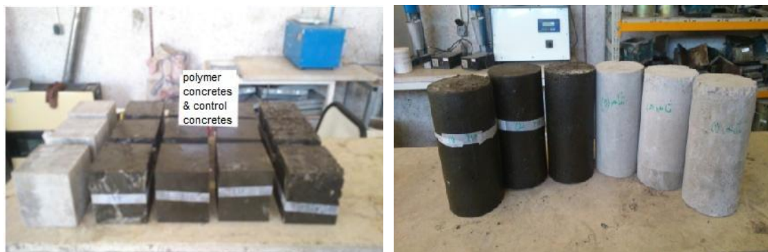
Fig.2. Built cubic and cylinder specimens

In figure 2 cubic specimens for checking compressive strength and cylinder specimen for checking bonding between polymer concrete and normal concrete are shown. Cylinder specimens are built in this form that first half volume of mold filled by concrete cement as the face on sample formed angle 30^\circ by the vertical line. After that concrete cement contains enough consolidation, another cylinder mold was filled with polymer concrete.