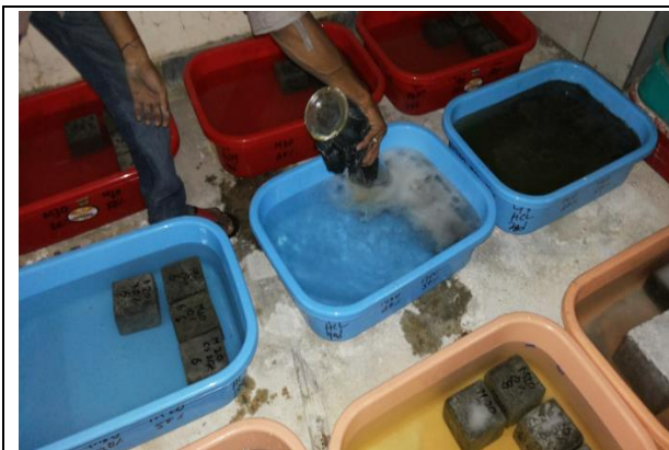
Figure 6: Acids Attack Testing