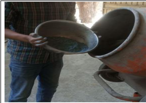
Figure 2: Concrete Preparation