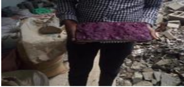
Figure 9: Concrete Exposed to Phenolphthalein Solution