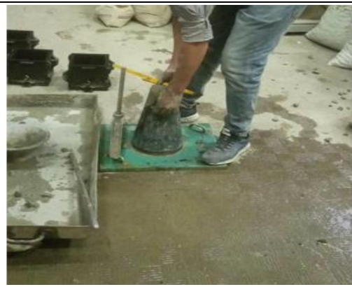
Figure 3: Workability Testing