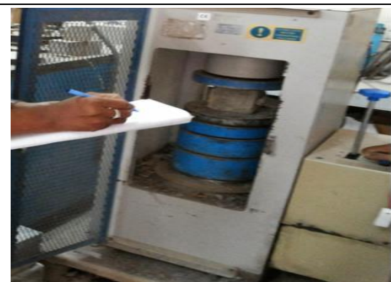
Figure 5: Compressive Strength Testing