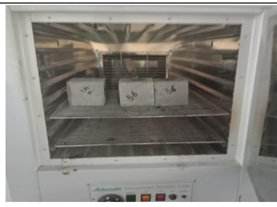
Figure 7: Water Desorption Testing