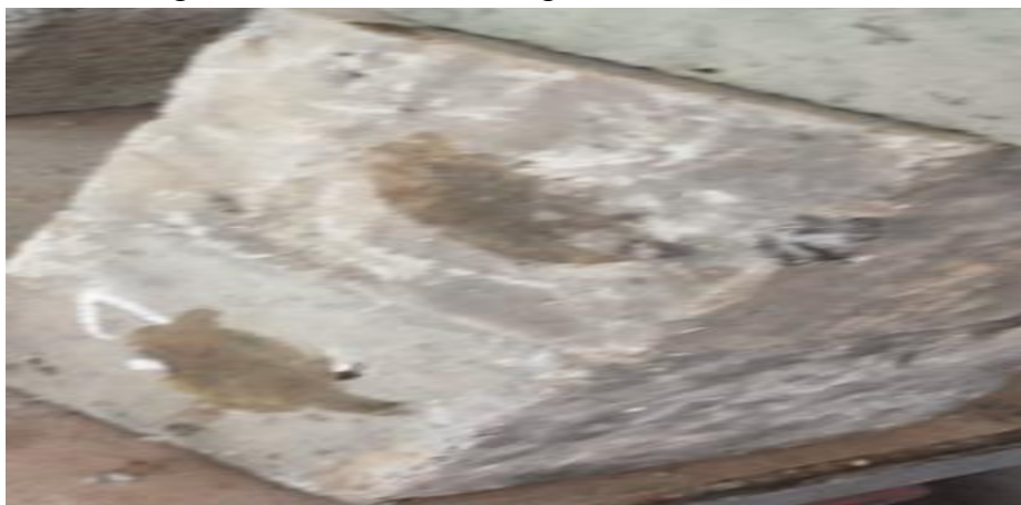
Figure 8: Self-Healing of Cracks in Concrete

For visualizing the auto-healing ability of cracks in concrete, cracks was intentionally developed and verified by magnifying glass for its healing which is shown in the figure