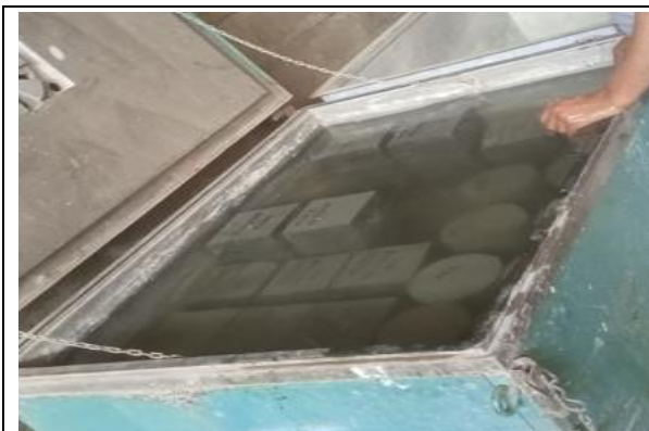
Figure 4: Curing of Concrete Specimens