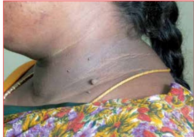
Figure 2: Acanthosis nigricans, neck grade III. Pigmentation on the lateral aspect of the neck, extending up to the posterior border of the sternocleidomastoid muscle

Figure 1: Receiver operating characteristic curve showing the sensitivity and specificity of the acanthosis nigricans grading in diagnosing insulin resistance