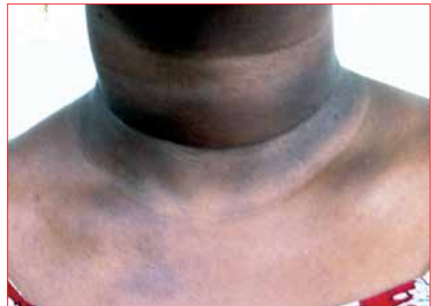
Figure 3: Acanthosis nigricans, neck grade IV. Pigmentation encircling the neck, and visible when facing the subject