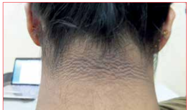
Figure 4: Acanthosis nigricans, neck grade II. Pigmentation at the base of the neck, texture IV. There are visible "hills and valleys" on the pigmented skin

and low-grade AN. The ROC curve nears the upper-left corner of the grid when there is higher sensitivity. From Figure 1, we derived that there was higher sensitivity with regard to the grades, and higher specificity for the acanthosis nigricans textures, when diagnosing IR.