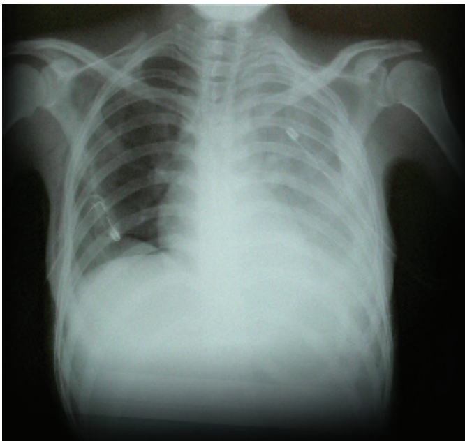
Chest radiography pre operatively with chest tube in place And bilateral effusion after talcum powder application