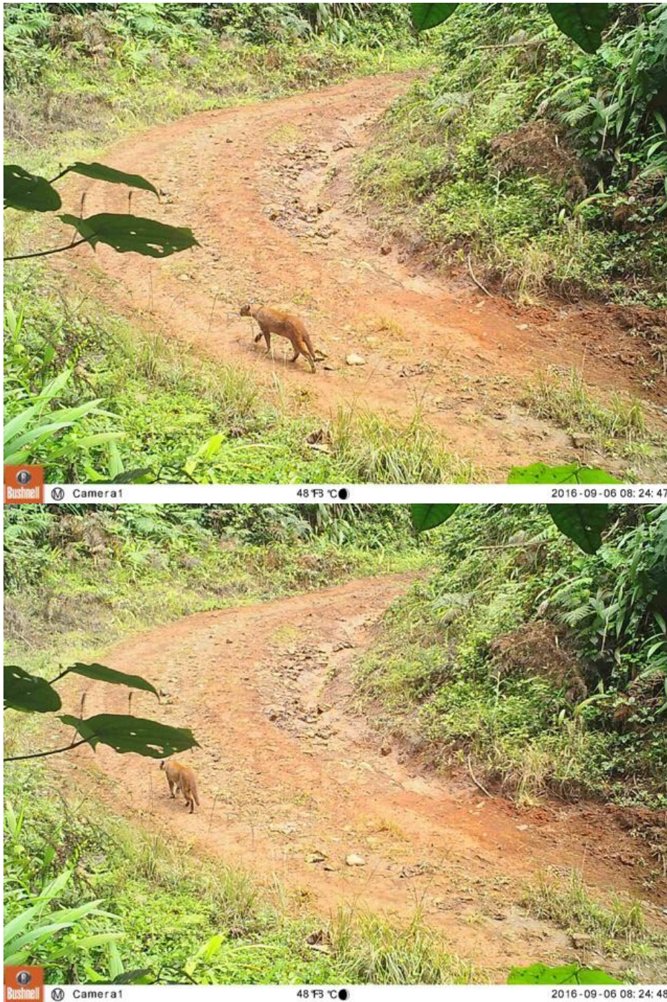
Figure 3. Camera trap images from Kieni Forest Reserve, Kenya, of a probable African golden cat Caracal aurata . The golden/reddish-brown pelage and the small, black-backed ears are characteristic of C. aurata .