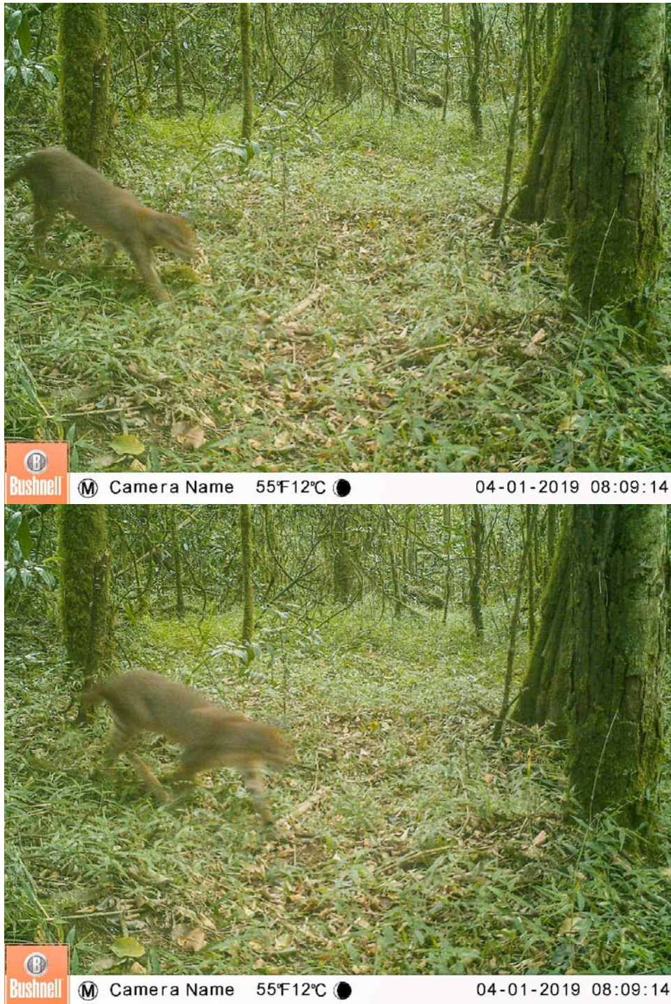
Figure 5. Camera trap images from Kieni Forest Reserve, Kenya, of a cat closely resembling an African golden cat Caracal aurata . The grey pelage and the prominent spotting on the inner legs are characteristic of C. aurata .