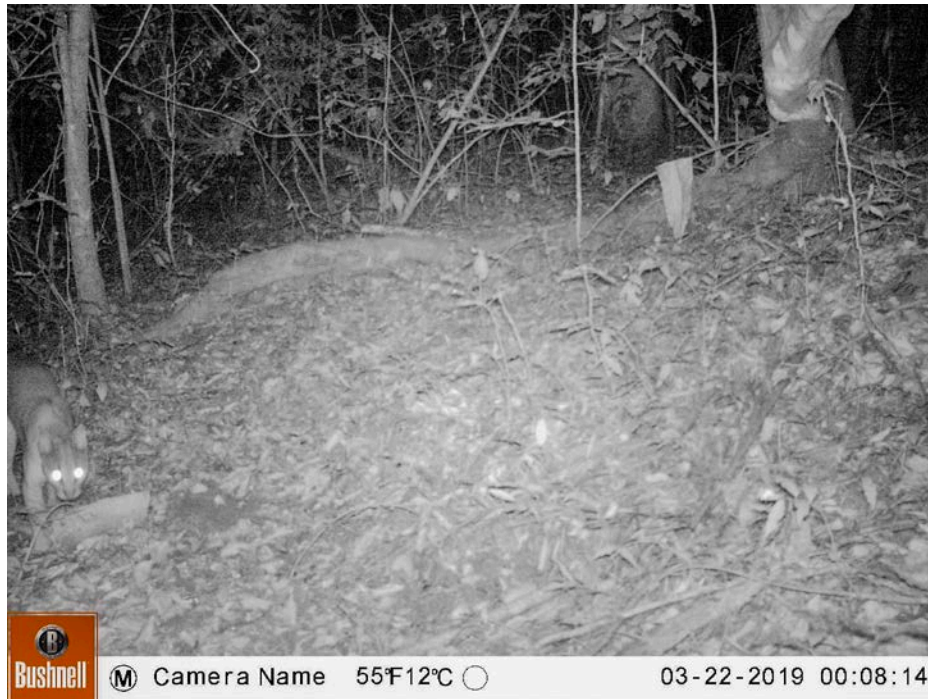
Figure 4. Camera trap image from Kieni Forest Reserve, Kenya, of a cat closely resembling an African golden cat Caracal aurata . The small, round ears that lack tufts are characteristic of C. aurata .