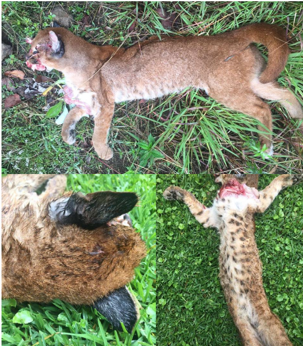
Figure 2. The African golden cat Caracal aurata specimen collected in Kieni Forest Reserve, southern Aberdares, south central Kenya. Features shown in these images that aided in identification include golden/reddish-brown pelage; small, round ears that are black behind and without tufts; short, forward-directed hair on back of head and neck; and prominent spotting on belly and inner legs.