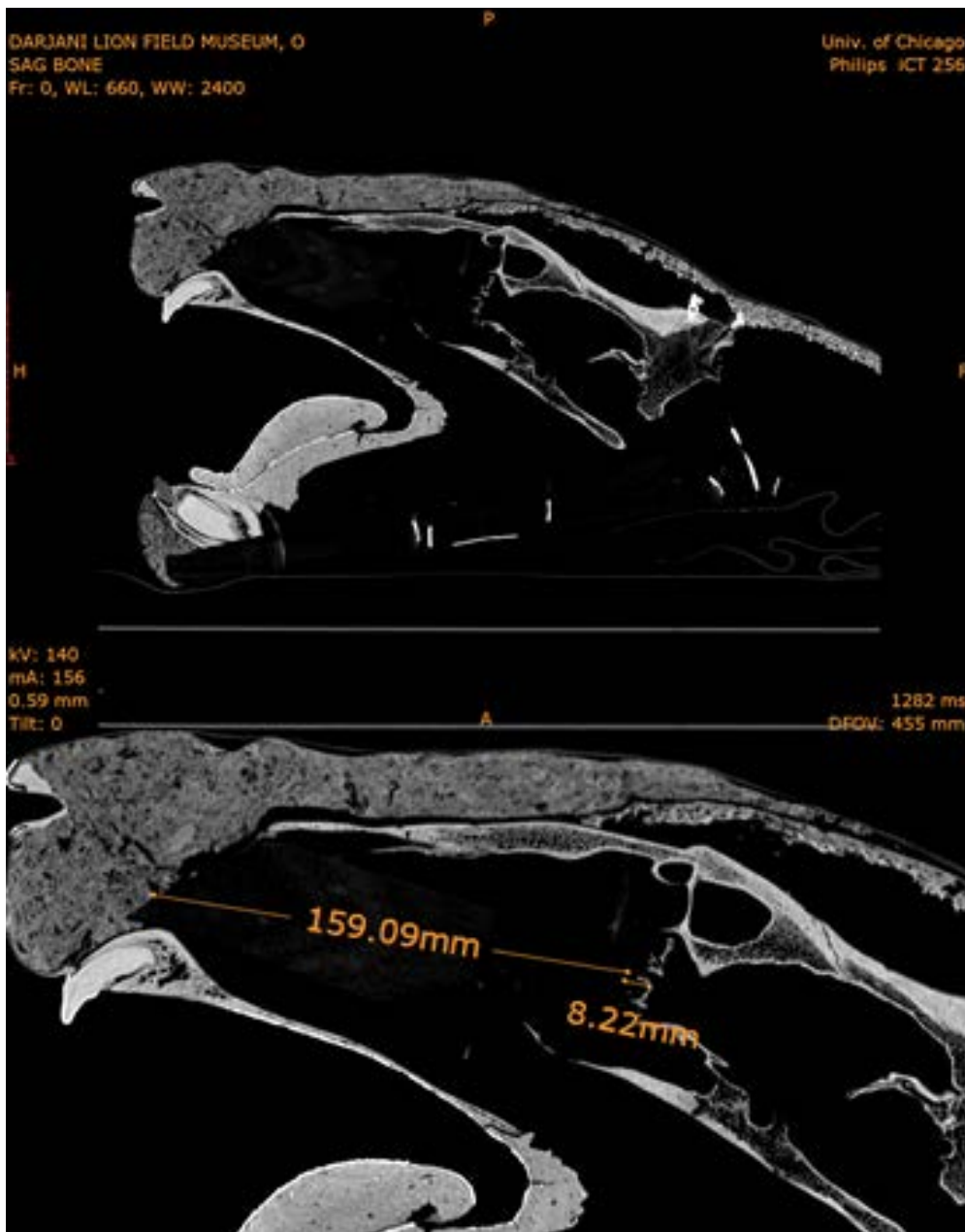
Figure 4. Sagittal CT scan of the Darajani lion skull. The upper figure shows the left slice at the level of the canine teeth. Note the absence of turbinates, the good preservation of the cribriform plate and the normal foramen magnum. The lower illustration is a close up of the same CT slice. A model of the quill, measuring 159.09 mm is positioned in the nasal cavities. Note that the tip of the model is positioned 8.2 mm from the cribriform plate.

small emaciated body but a large skull. The discrepancy may be an illusion as a regular-sized head may appear bigger on the emaciated body of a poorly-maned lion.