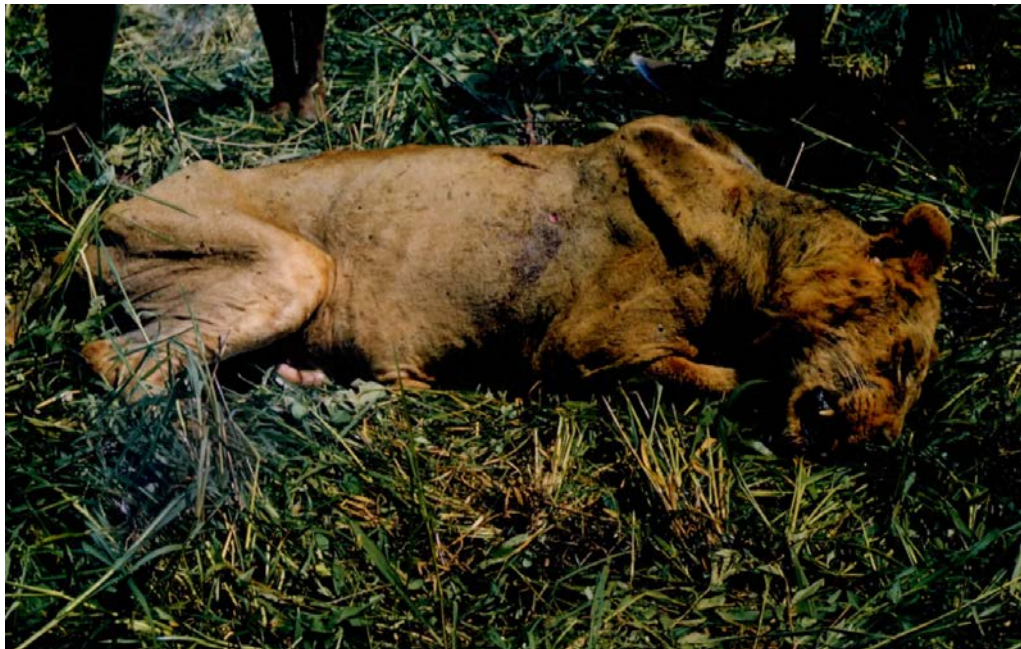
Figure 1. Darajani lion just after he was killed. Note the very thin body, scrawny mane and protruding shoulder, pelvic bones and ribs.

Our case study of the 'Man-eater of Darajani' reveals an emaciated male with protruding backbone, scapula, ribs, limbs and pelvic carriage (figure 1). The lion's mane was sparse and partially developed; however, this is typical for lions of this age and in this region (Gnoske et al. , 2006). A porcupine quill with a total length of 239 mm was planted in the left nostril; 159 mm of it remained embedded (figure 2). There were a few other quills in the chest and shoulder (Kingsley-Heath, 1965). The quill in the nostril (figure 3) was complete but was creased where it emerged from the nostril, likely due to repeated impact. Both species of crested porcupine are present in Kenya and Tsavo is near the boundary of both species (Happold, 2013a,b). We could not determine the species based on the quill alone; therefore, we refer to this porcupine as ' Hystrix sp.'