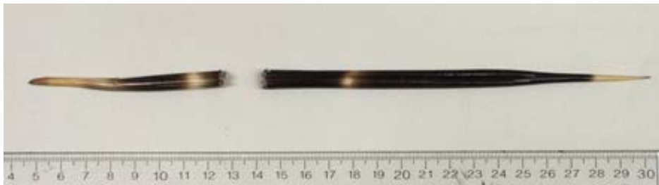
Figure 3. Porcupine's quill from the Darajani lion. The quill is broken into two pieces. The longer piece, measuring 159 mm, was lodged into the lion's left nasal cavity.

Utilizing CT scan at high resolution, we determined that lion skull sutures (including the interparietal, interfrontal, basioccipital and squamous-parietal) were still open. The teeth were fully developed and unworn, thus establishing that the lion was a young adult approximately 4 years of age (Smuts et al. , 1978). The CT scan (figure 4) showed that the turbinates were missing as a result of the taxidermy process, but the frontal sinuses, cribriform plate, mastoid bulla, tentorium cerebellum , foramen magnum , and all other cranial bones were of normal aspect. Skull measurements were within the normal range in comparison to a series of 29 Tsavo male lions in our database (unpublished data). Our measurements contradict Kingsley-Heath's statement that the Man-eater of Darajani had a