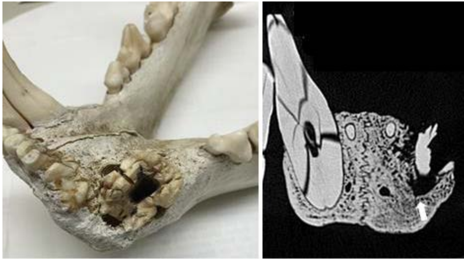
Figure 6. Left half of the figure represents the front of the mandible of Kenya male lion FMNH 213656. The right figure represents a coronal section by CT scan of the same specimen. Note that the left half of the mandible in front of P3 is larger than the right side. The white arrow indicates an abscess below the broken canine.

the aggressor with its sharp quills (Hopkins, 2015). Stokes (1943) refers to a porcupine ‘trick’ of stopping suddenly when pursued by a predator, thereby impaling it. One of our colleagues was impaled by a porcupine that jumped backwards into him as he tried to rescue it from a garbage pit (see also Aydın et al. , 2017).