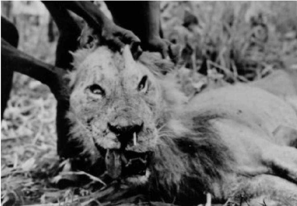
Figure 2. Close-up of the Darajani lion head showing the portion of the quill over-hanging from the left nostril (modified from Kerbis Peterhans & Gnoske 2001).