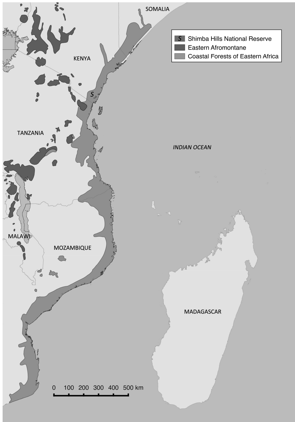
Figure 1. Map of the historical coverage of the east African coastal forests showing the location of Shimba Hills National Reserve.