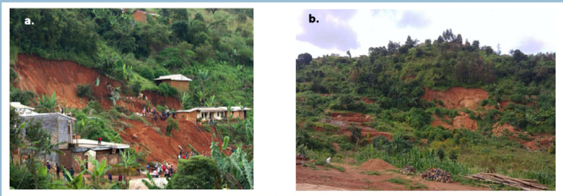
Landslide site at Gouache showing: a) the landslide scar in the centre and buildings that were unaffected at the side of the scar; and b) demolition of these buildings after the landslide event